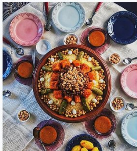
Couscous served with vegetables and chickpeas