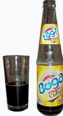
A bottle of Boga Cidre