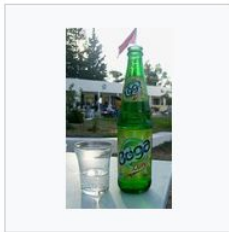
Bottle of Boga Lim