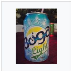
Can of Boga Light

The last version is the Boga Menthe. "Menthe" meaning mint in French. This version is bright green in color and is the association of the Boga Lim with mint syrup, giving it a distinctive mint-lime taste. Its packaging is mainly dark green.