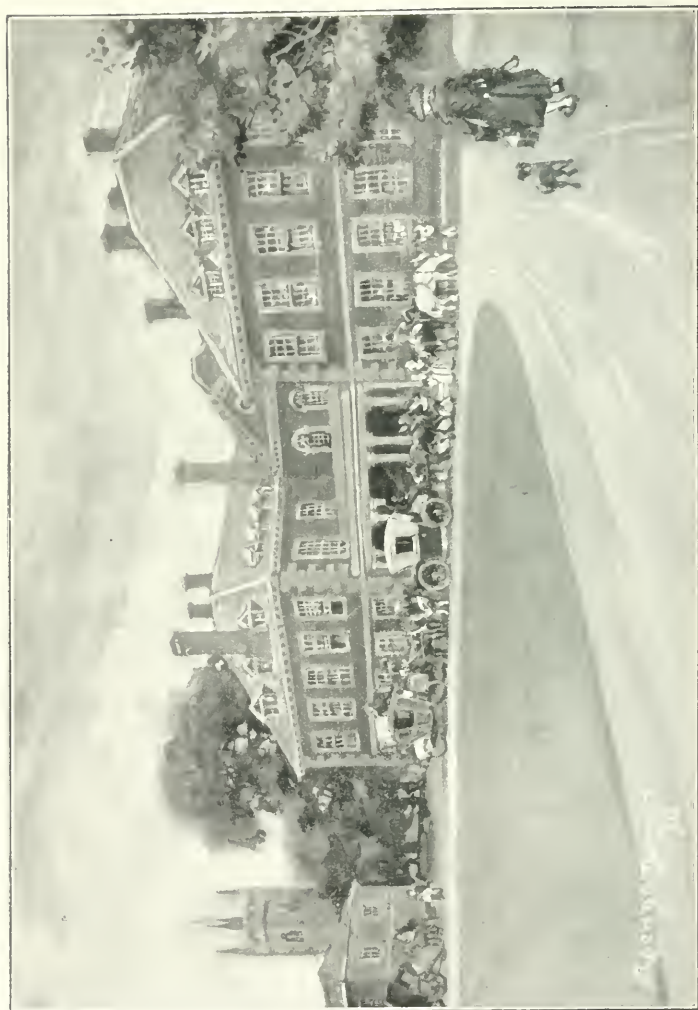
THE CASTLE INN.

From a Water-Colour Drawing at Marlborough College.