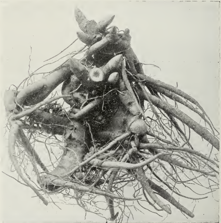
A Dormant Peony Root

And the cost, too, in some of the most desirable low-priced sorts will prove quite moderate, since the plants for this purpose may be set 2\frac{1}{2} to 3 feet apart, and a single row is quite ample.