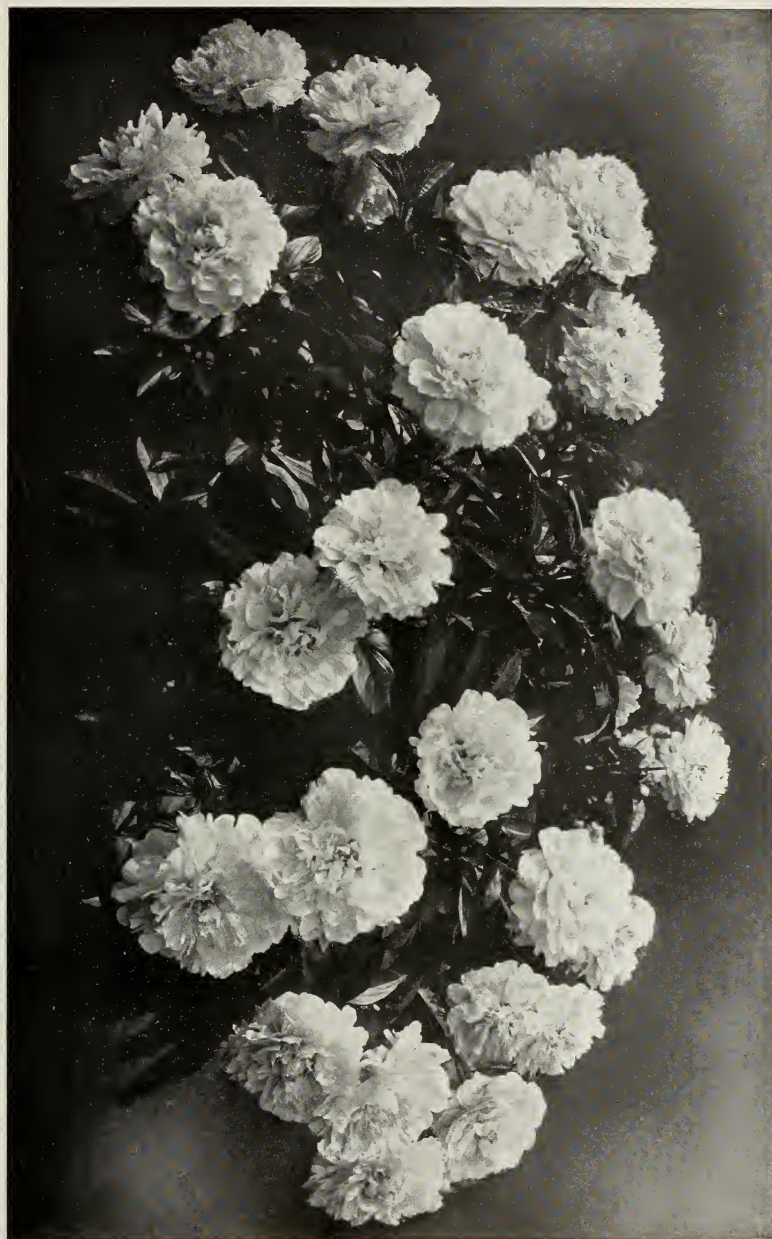
A SINGLE PLANT OF EUGENIE VERDIER (See page 22)