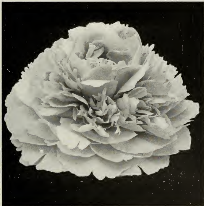
Triomphe de Lille (See page 22)

EUBRA SUPERBA (Richardson). Deep, rich, brilliant crimson. Large, full flower; strong grower. Blooms when nearly all other Peonies are gone. Fair bloomer on established plants, but does not do much the first year or two. Undoubtedly the best very late crimson. 1—2.