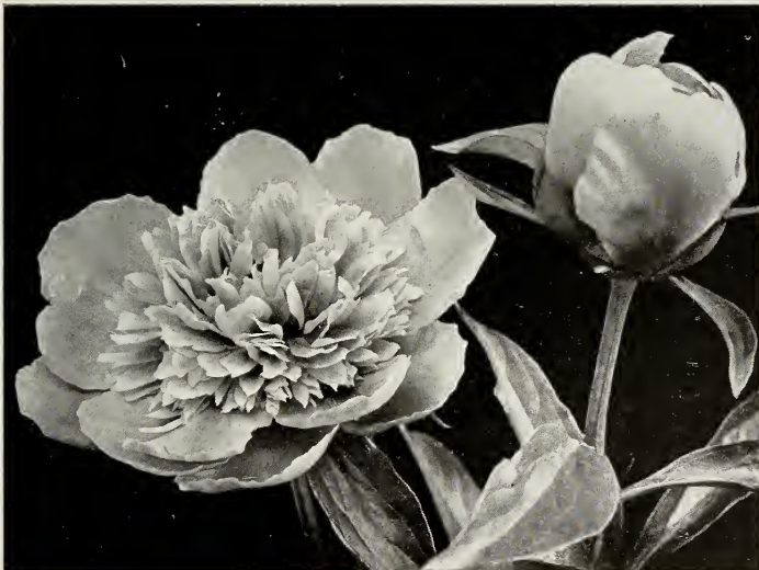
General Bertrand (See page 16)

Of course, there will always be some blind growths, even on