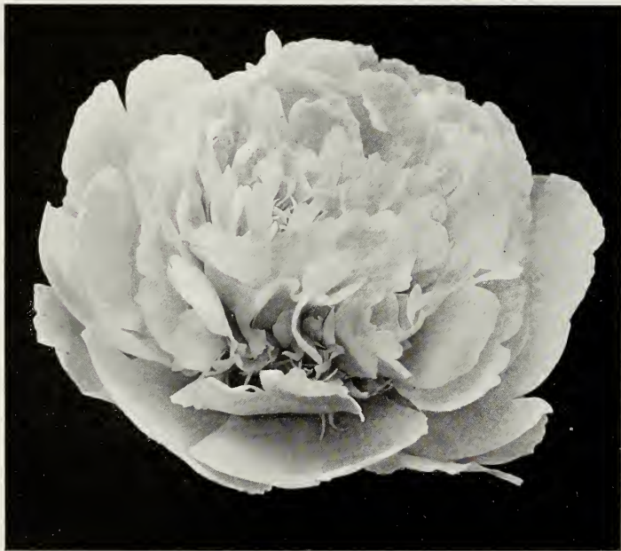
Octavie Demay (See page 20)

The Peony, in fall can stand without injury a journey of months, if kept from prolonged heat, which would start it into growth. There is, in fact, no flower which can be transported over long distances with greater safety.