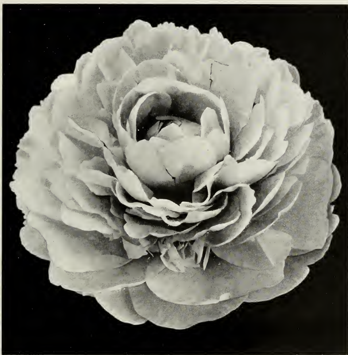
Asa Gray (See page 19)

MONS. MARTIN CAHUZAC (Dessert). Large to very large, full and well-formed flower. A solid ball of very deep maroon with blackish lustre, changing to metallic. Good erect habit. A variety of surpassing merit and by far the darkest Peony yet produced. Despite its high price we are obliged to omit it from the catalogue for a year or two every few years, as our stock soon becomes depleted. 1 year, $5.00.