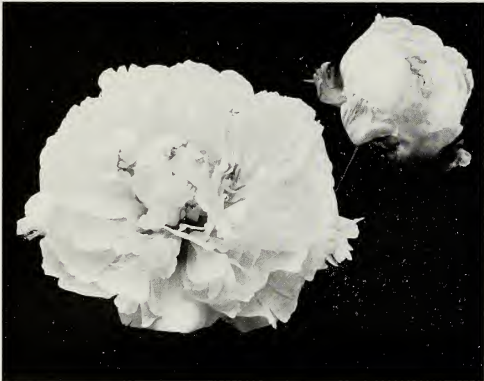
Mons. Dupont (See page 19)

Above discounts apply to everything except the three collections on page 28, which are net at the special prices quoted.