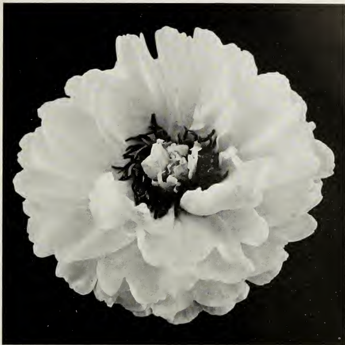
La Rosiere (See page 19)