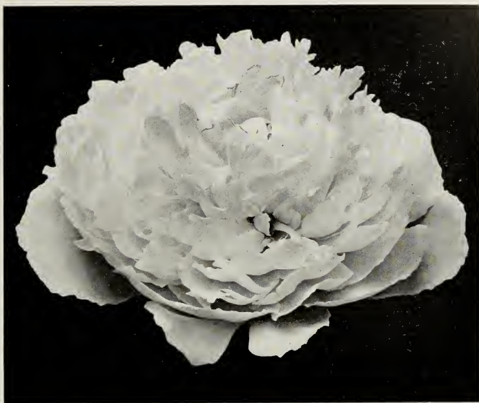
Avalanche (See page 22)