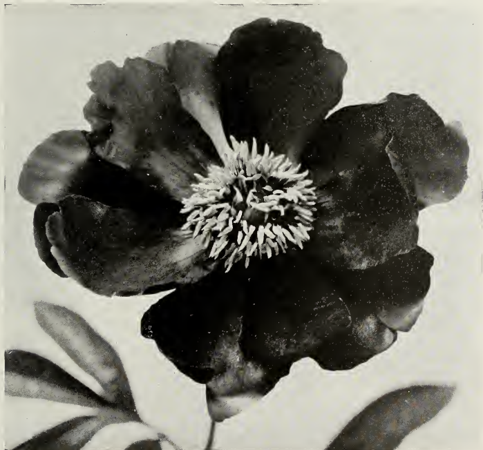
The Moor (See page 26)

PIERRE DESSERT (Mechin). Brilliant, dark amaranth-red flower shaded garnet with velvetish reflex. Large, full bloom. 1—2.