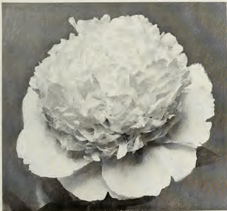
Mad. de Verneville (See page 17)