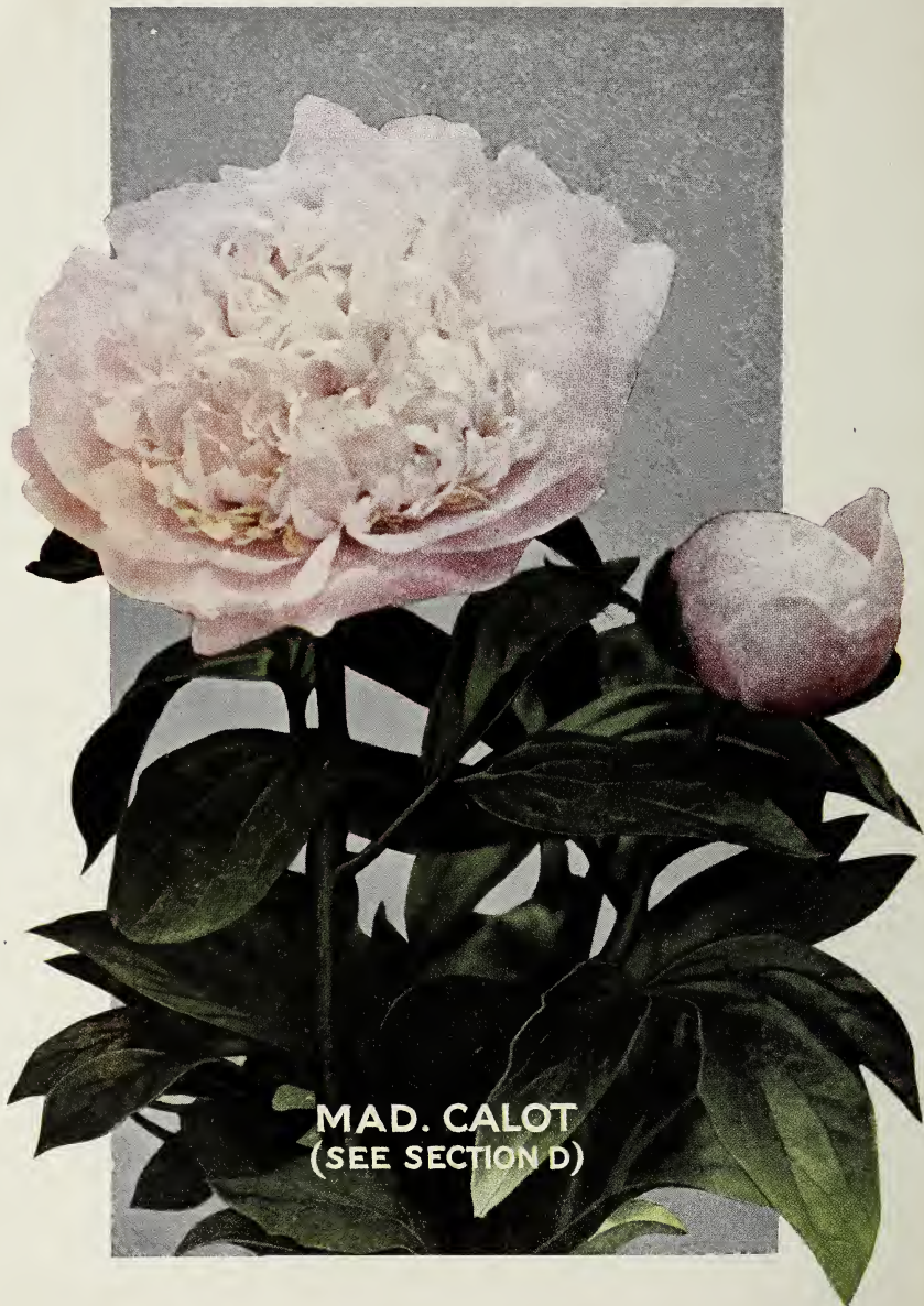
MAD. CALOT (SEE SECTION D)