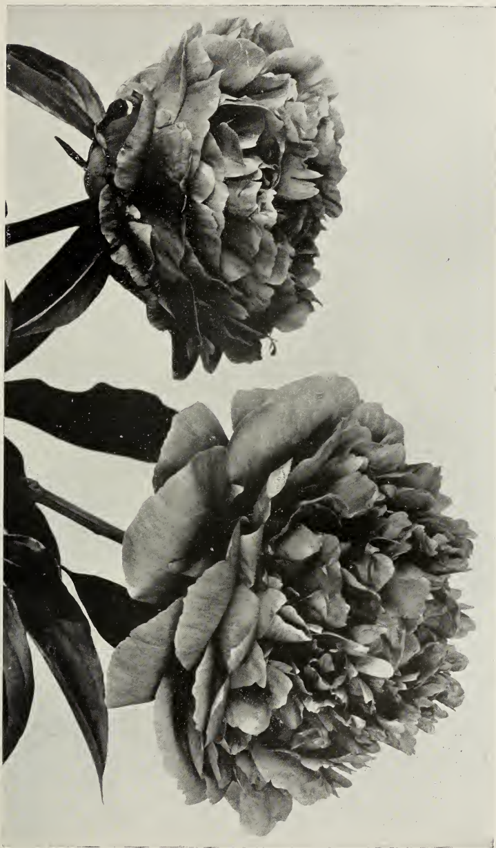
MONS. KRELAG (See page 22)