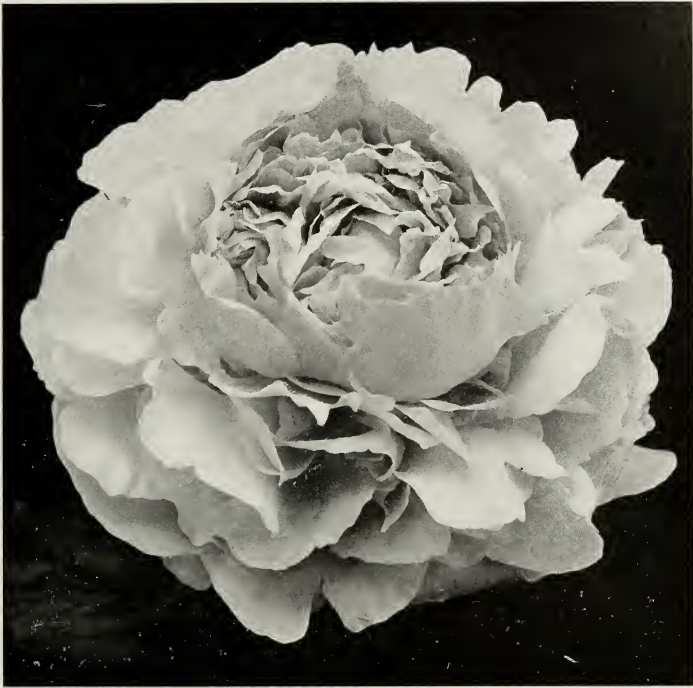
Pierre Duchartre (See page 25)