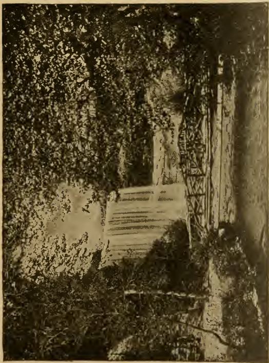
THE FALLS OF MINNEHAHA.