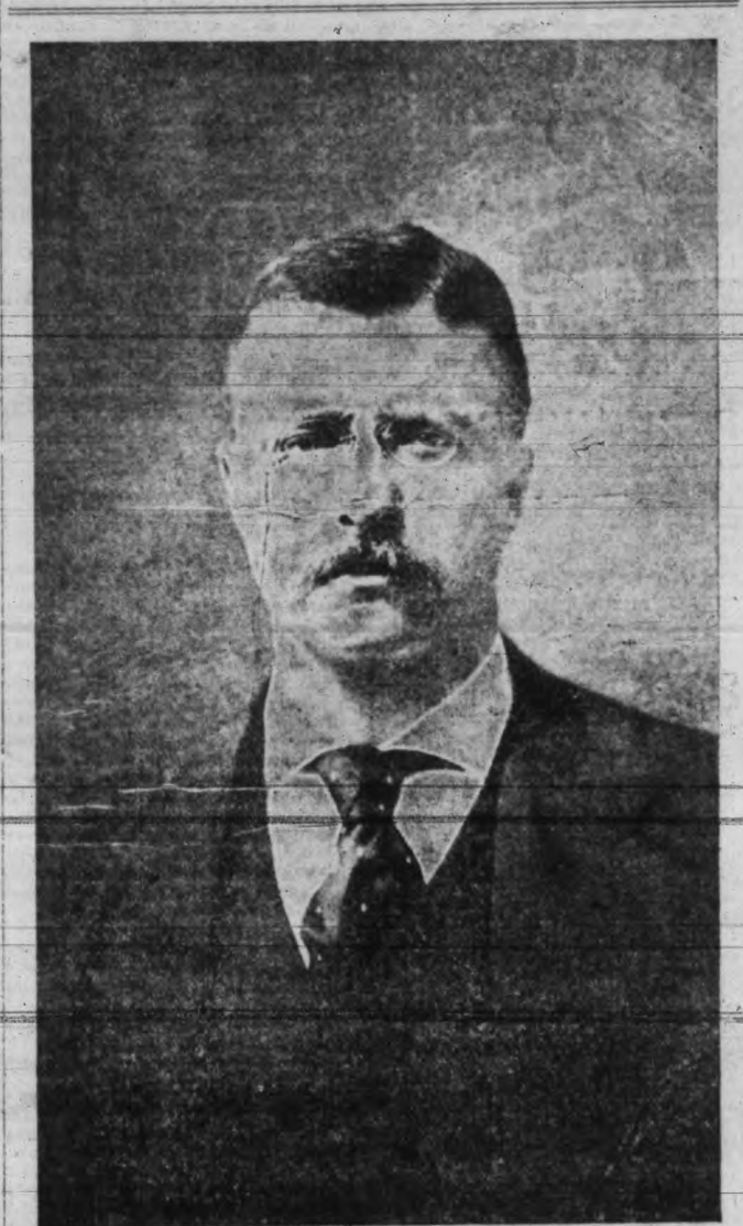
PRESIDENT THEODORE ROOSEVELT.

(Associated Press.) Milburn House, Buffalo, Sept. 14.—William McKinley, 25th President of the United States, died at 2:15 o'clock this morning from the effect of an assassin's bullet. Theodore Roosevelt, 26th President of the United States, succeeded to that exalted office under the constitution and laws of the country, and with the administration of the oath of office to-day he will begin to exercise the functions of President. In these statements are embraced the consummation of an awful tragedy—and the historic event by which the en-