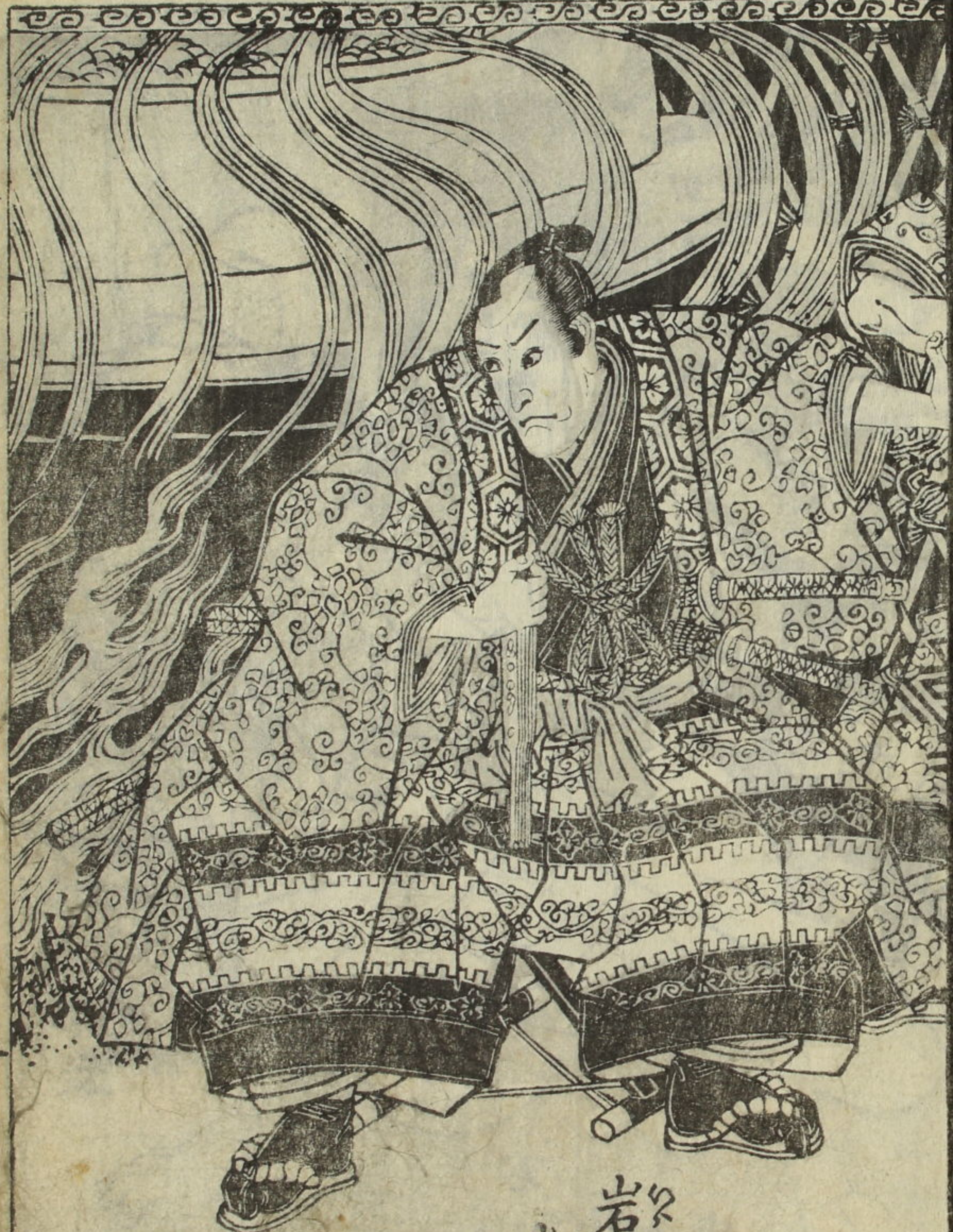
岩木 當馬 丞 いのみき とうま じやう