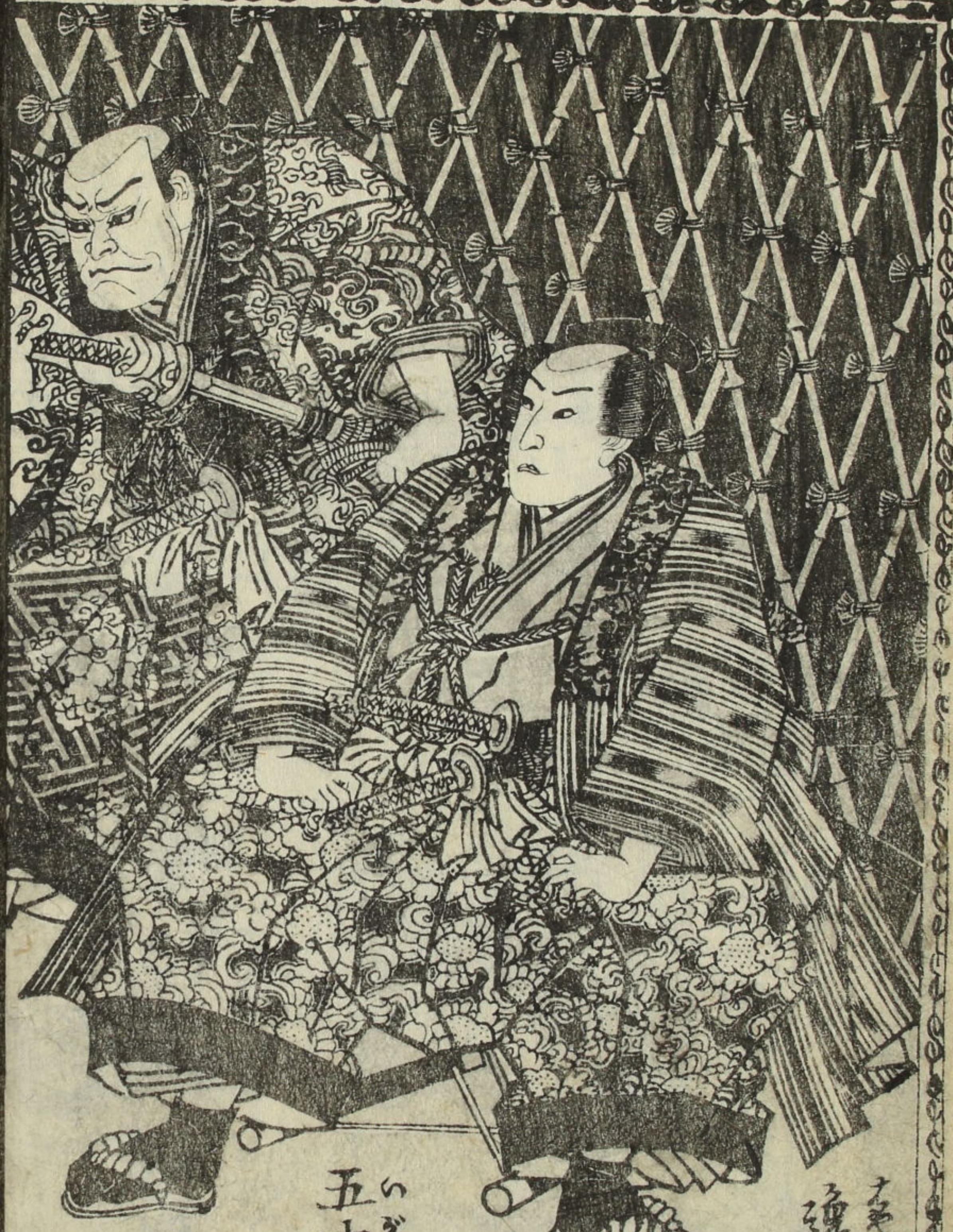
五十嵐 軍藏 いそがし ぐんざう