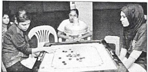
A player aims to pot during the Chandigarh State Carrom Tournament, on Monday.