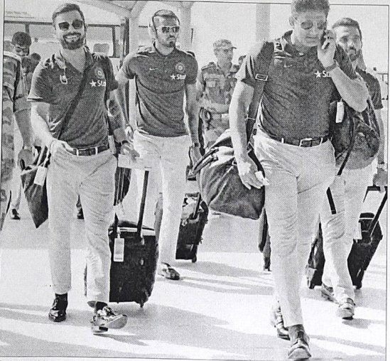
The Indian cricket team leaves for Ranchi from the international airport in Mohali on Monday.