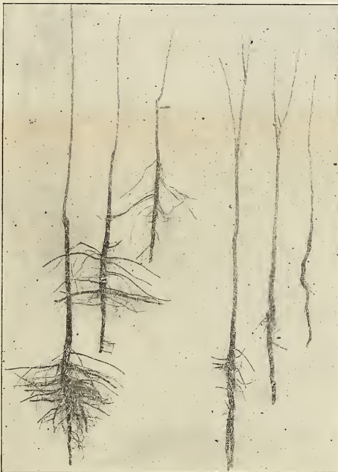
The Root System We Grow. The Kind of Roots usually grown.

The kind of tree you buy is your foundation. Buy the best.