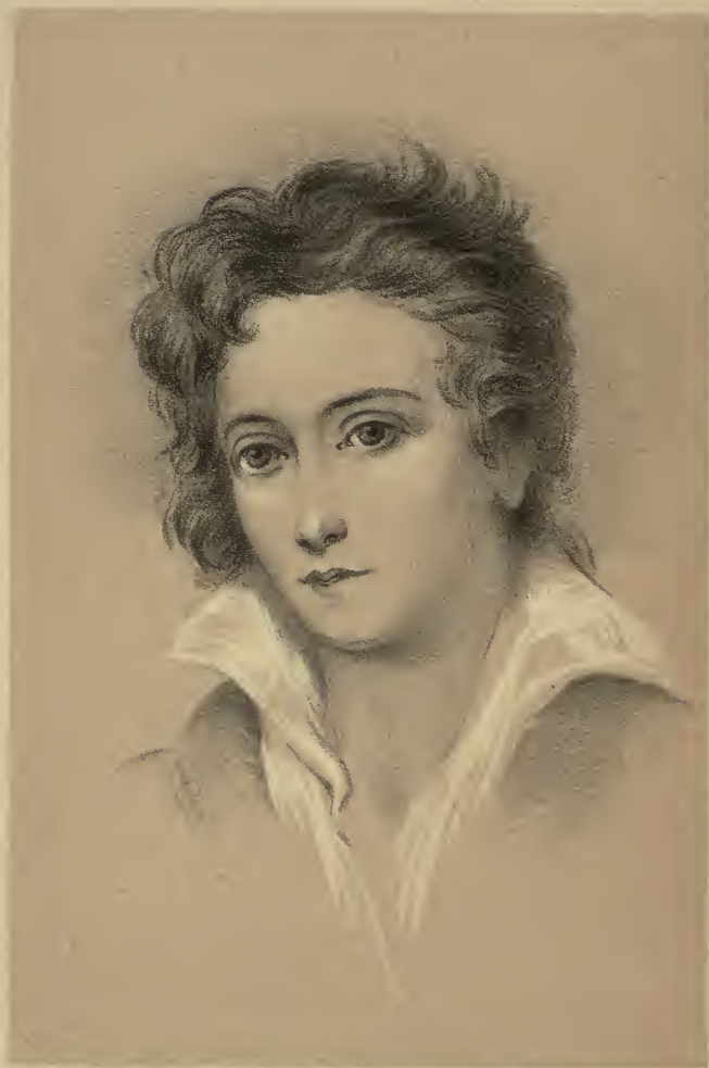
PERCY BYSSHE SHELLEY, FROM THE ORIGINAL PICTURE BY CLINT.