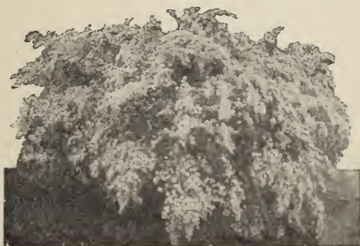
Spirea Van Houtti