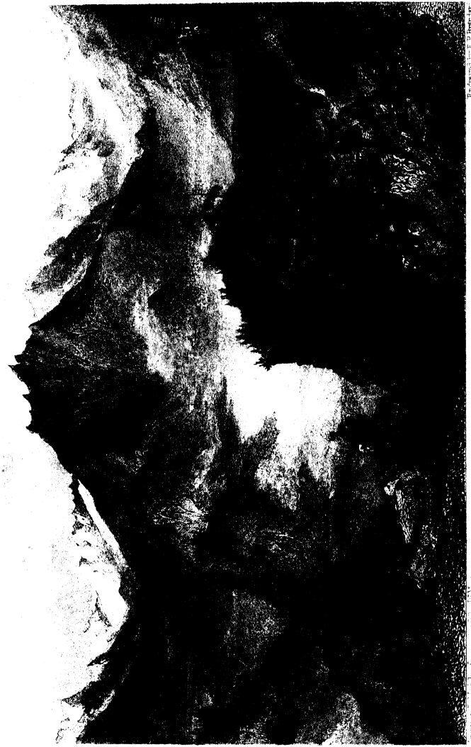
Fig. 1. View of the cave entrance.

1. The cave entrance is located in the center of the rock face.