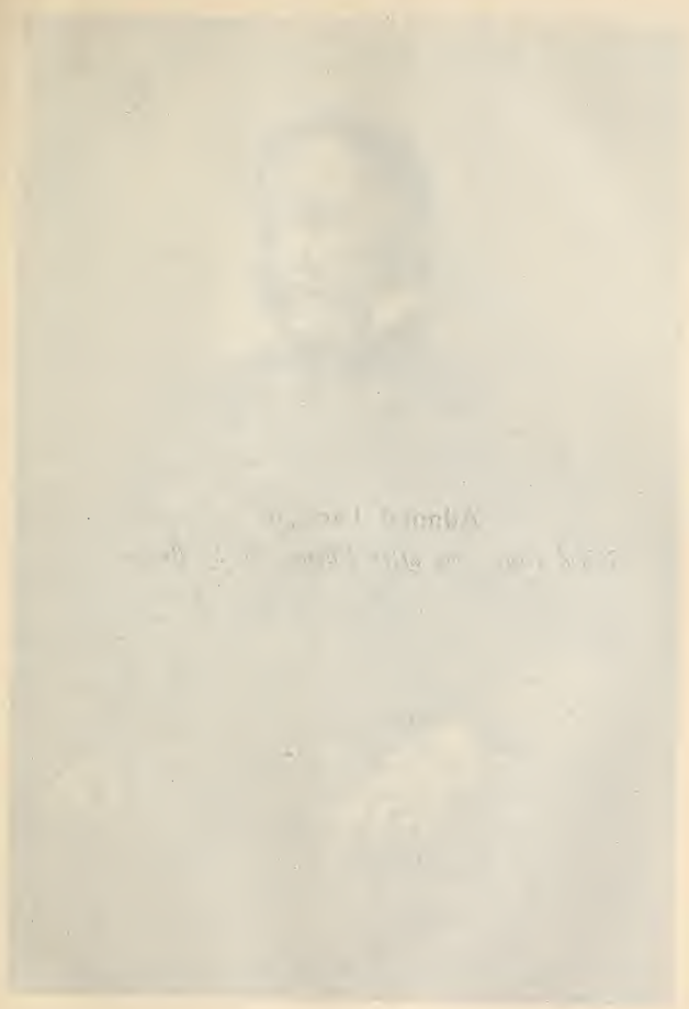
Portrait of [Name] [Title] [Date]