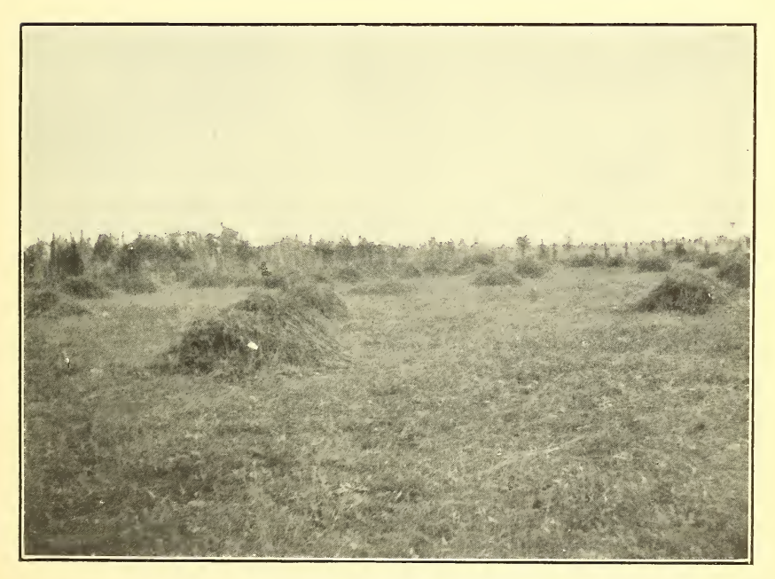
FIG. 2.-GRAIN HAY, KENAI STATION.