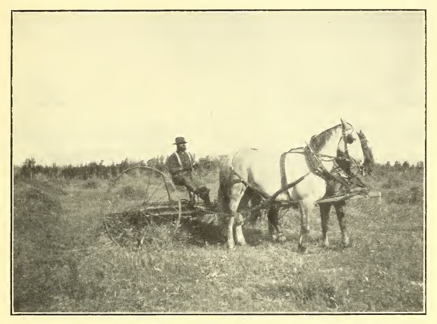
FIG. 1.-RAKING GRAIN HAY, KENAI STATION.