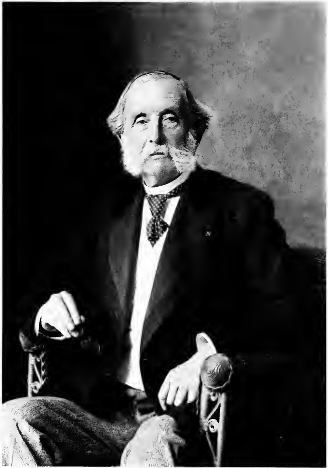
Thomas Wentworth Higginson