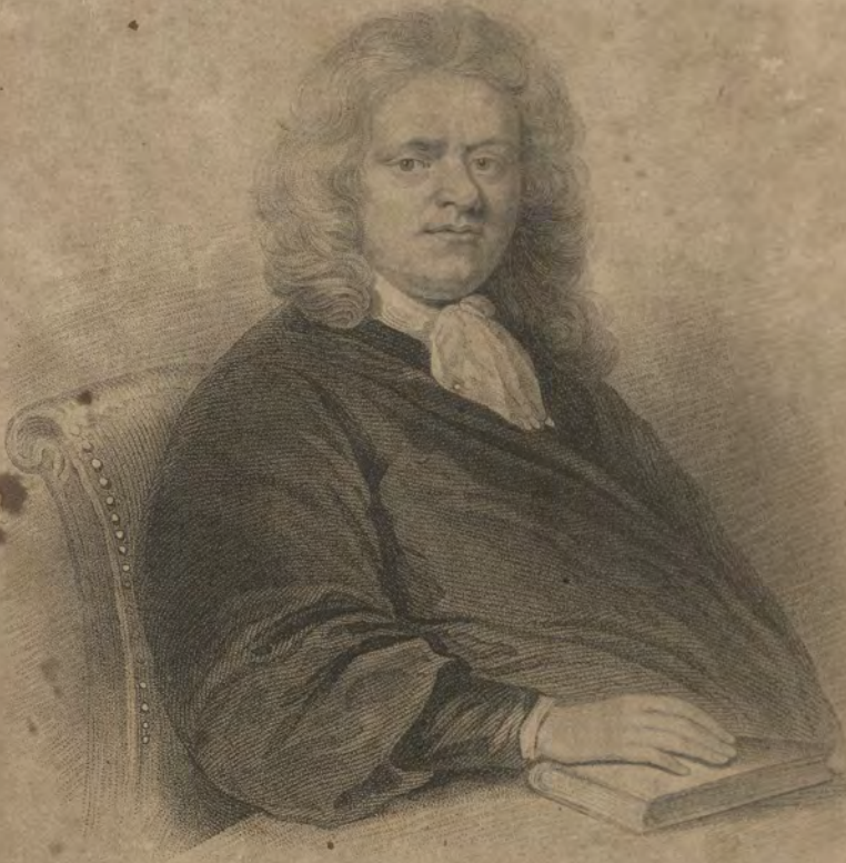
WILLIAM CARSTAIRS PRINCIPAL OF THE UNIVERSITY OF EDINBURGH