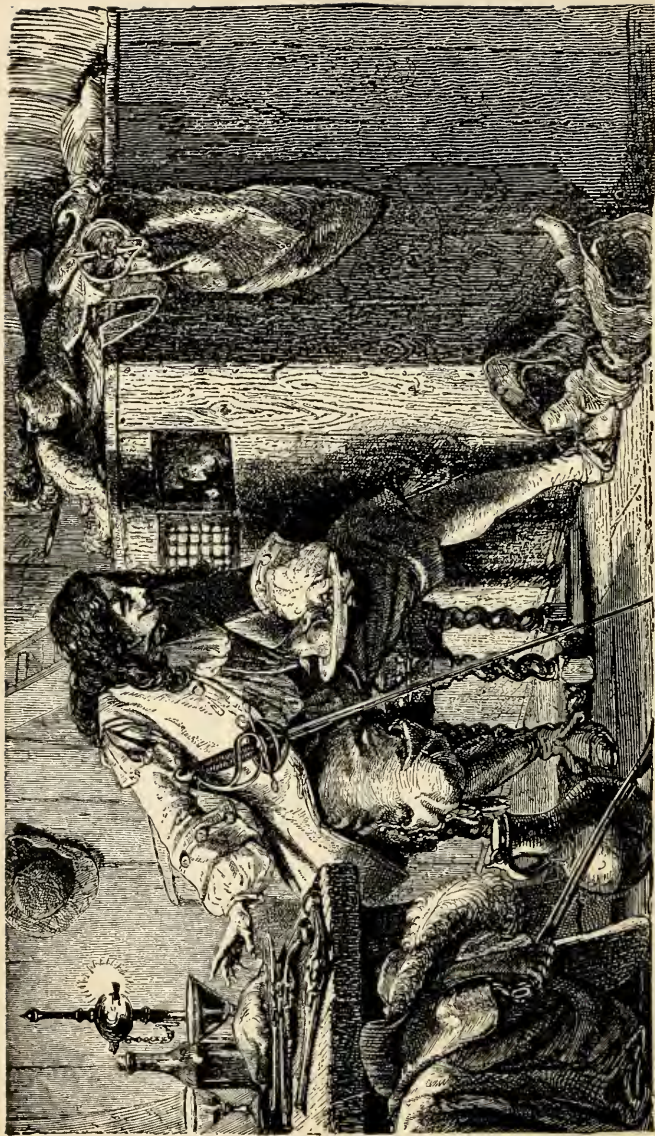
D'ARTAGNAN PASSED TWO DAYS AND TWO NIGHTS CLOSE TO THE COFFIN. — Page 198.