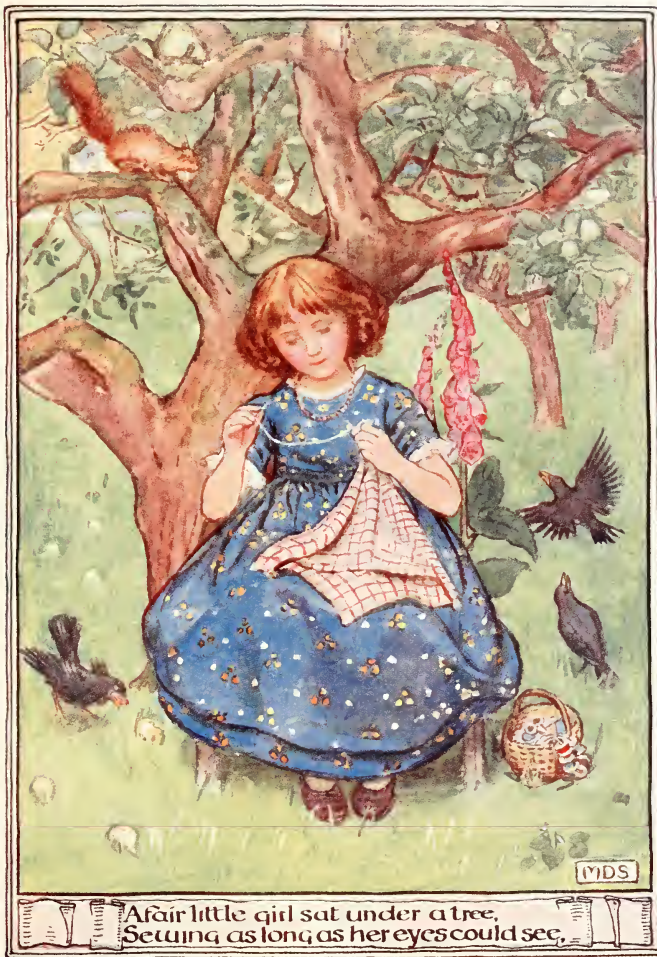
A fair little girl sat under a tree, Sewing as long as her eyes could see.