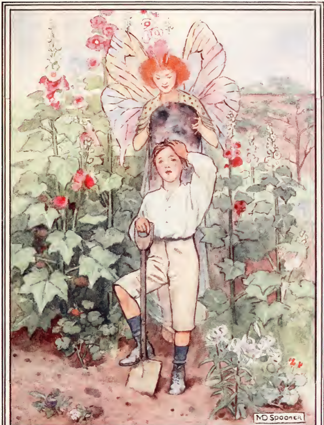
LIFTED THE HUMP — THE HORRIBLE HUMP — THE HUMP THAT IS BLACK AND BLUE !