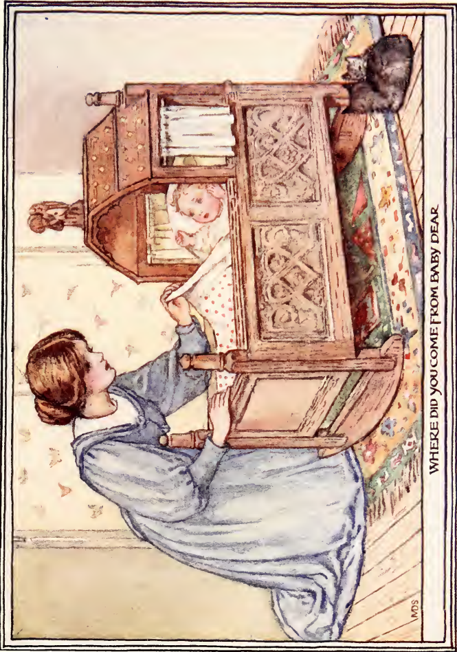
WHERE DID YOU COME FROM BABY DEAR