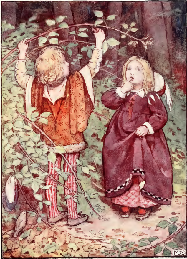
THEIR PRETTY LIPPES WITH BLACK BERRIES WERE ALL BESMEAR'D AND DYED