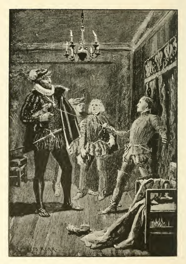
"He did not stir, and I could not do it."-See p. 71.