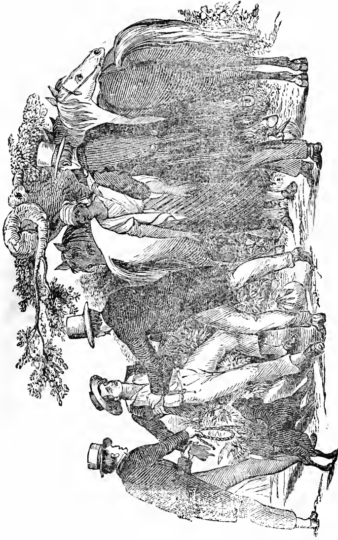
The author and his mother arrested and carried back into slavery.