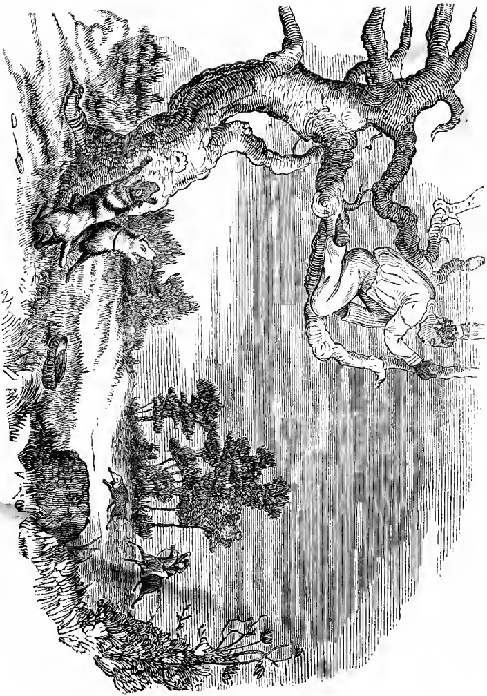
The author caught by the bloodhounds. (See p. 21.)