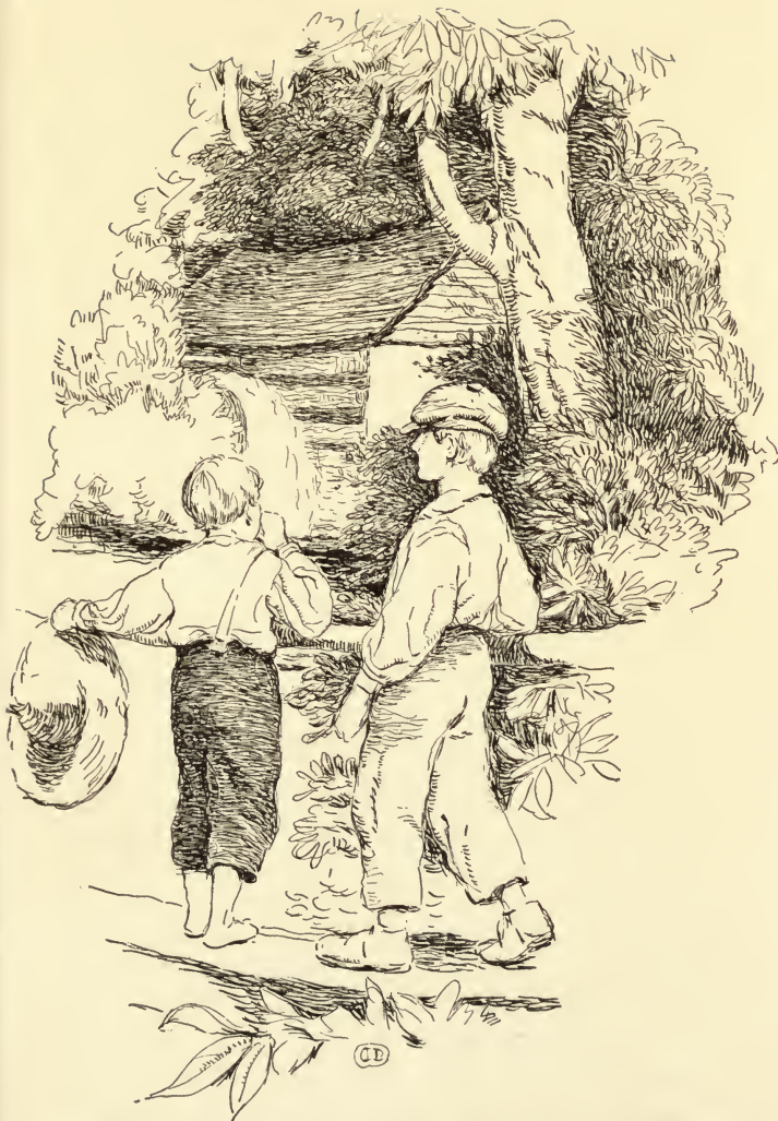
OCCASIONALLY WE WENT TO SEE HIM ON SATURDAY AFTERNOONS