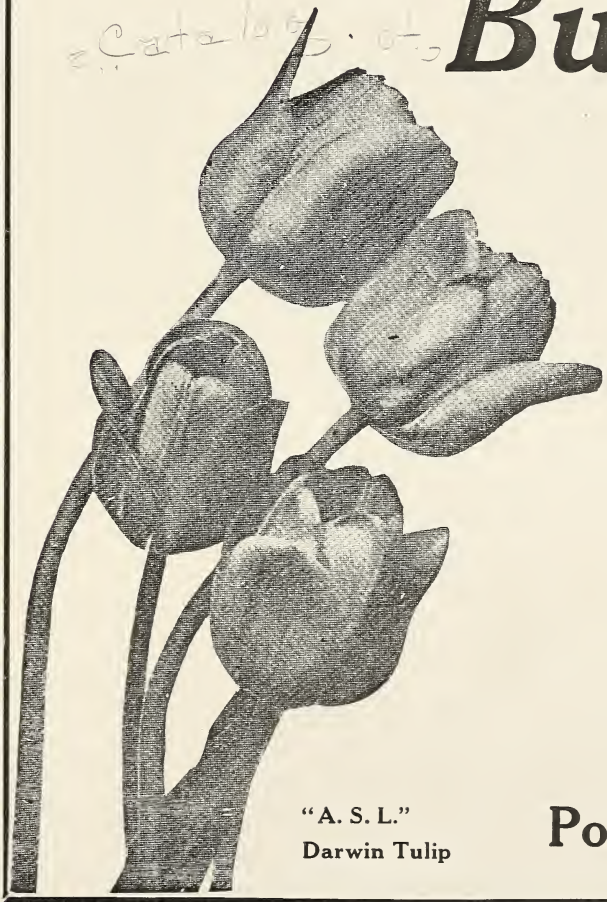
"A. S. L." Darwin Tulip