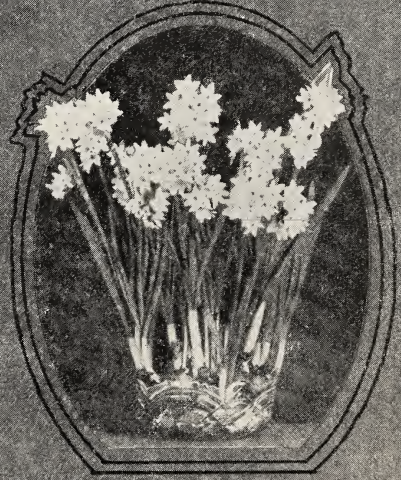
PAPER WHITE NARCISSUS