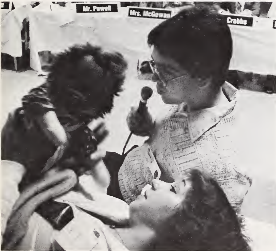
Video cameras record some of the discussions on future 4-H programs in consulting group sessions. (480A355-22)