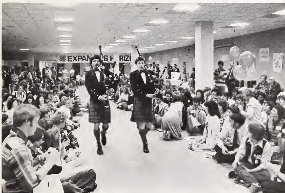
4-H'ers present "Expanding Horizons," a production of the University of Tennessee's Extension staff that celebrates 50 years of National 4-H Conferences. (480L381-27)