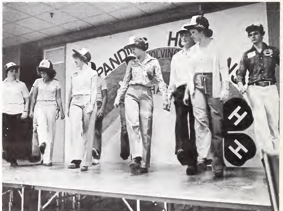
A song-and-dance routine highlights "Family Involvement in 4-H." (480A374-36)