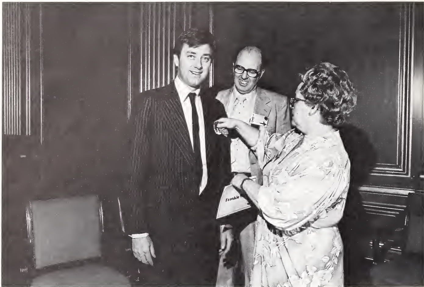
Senator Larry Pressler (S. Dak.), a former 4-H member, is spruced up by conference officials prior to his address to 4-H delegates. (480L381-5)

1959, conferences have been held at the National 4-H Center. The conferences are conducted by USDA's Science and Education Administration (Extension), the Cooperative Extension Services of the States, the National 4-H Council, and 4-H members.