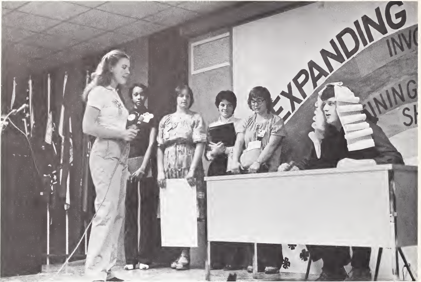
The jury brings in a "yes" verdict to the question, Does 4-H make a difference? (PN-6912)