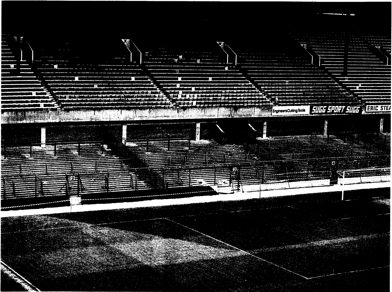
Appendix 3: The west stand and terraces.