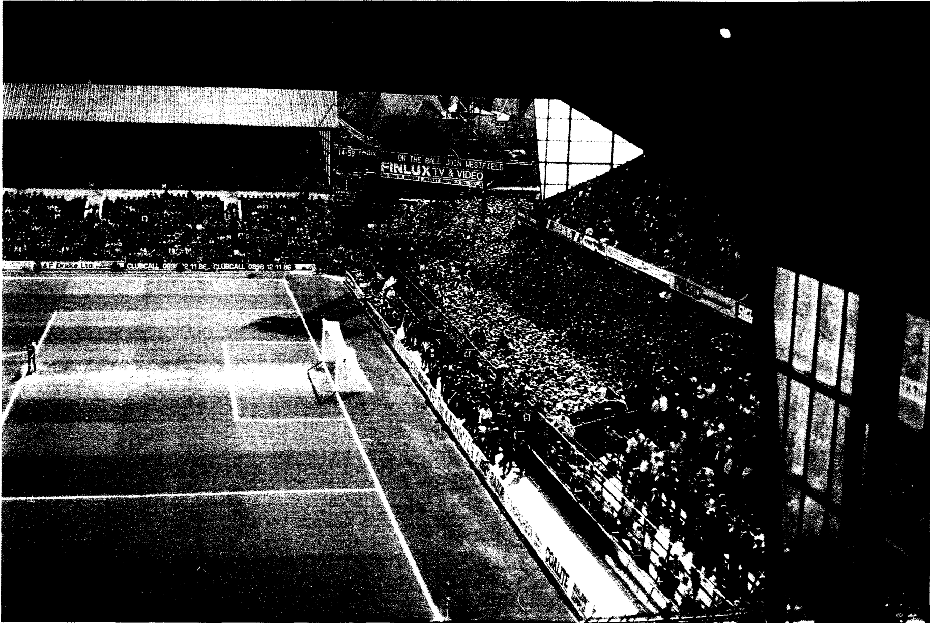
Appendix 5: The west terraces at 2.59 p.m.