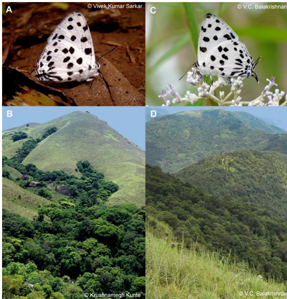
Image 2. Tajuria maculata in the Western Ghats. A - 19.xi.2009, mudpuddling, in the Brahmagiri Wildlife Sanctuary; B - Habitat at the Brahmagiri, on way to Narimalai Guest House; C - 02.x.2010, feeding from flowers of Knoxia sumatrensis at Kottathalachimala; D - Habitat at Kottathalachimala

(Image 2A) from 1100 to 1130 hr near the Iruppu Falls, a popular tourist destination (approximately 300–500 m, 11°57.8'N & 75°58.5E). The other three were seen feeding on white flowers of an unidentified straggling vine in a shola forest patch near the Narimalai Guest House, at 1,300m. These individuals were feeding well above the ground, constantly chasing each other, and could not be photographed.