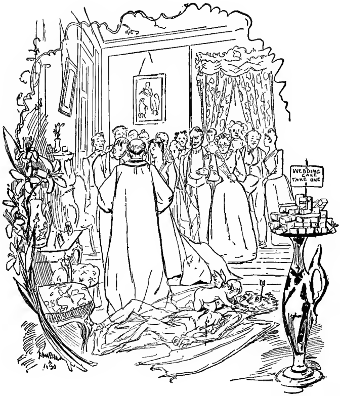
"FINALLY THERE WAS A QUIET WEDDING AT THE TOWERS"