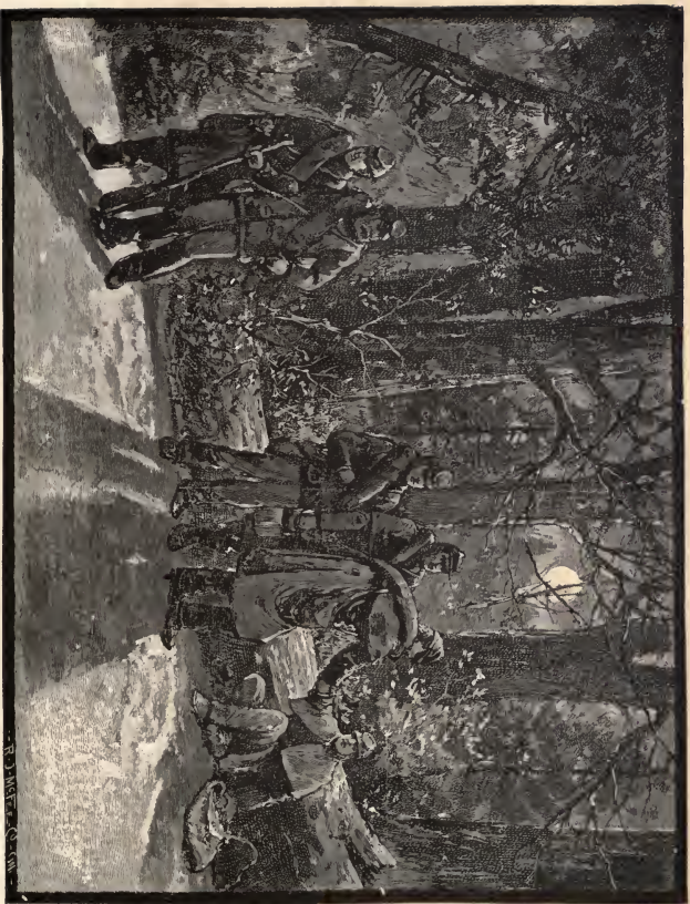
"LEFT ALONE."—PAGE 53.