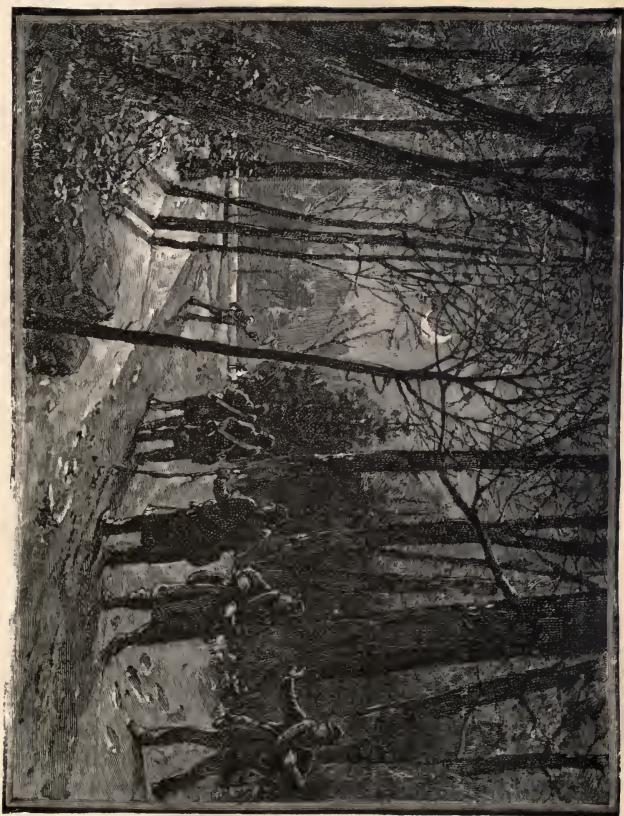
"FOILED AT SEVEN-MILE FERRY."—PAGE 20.