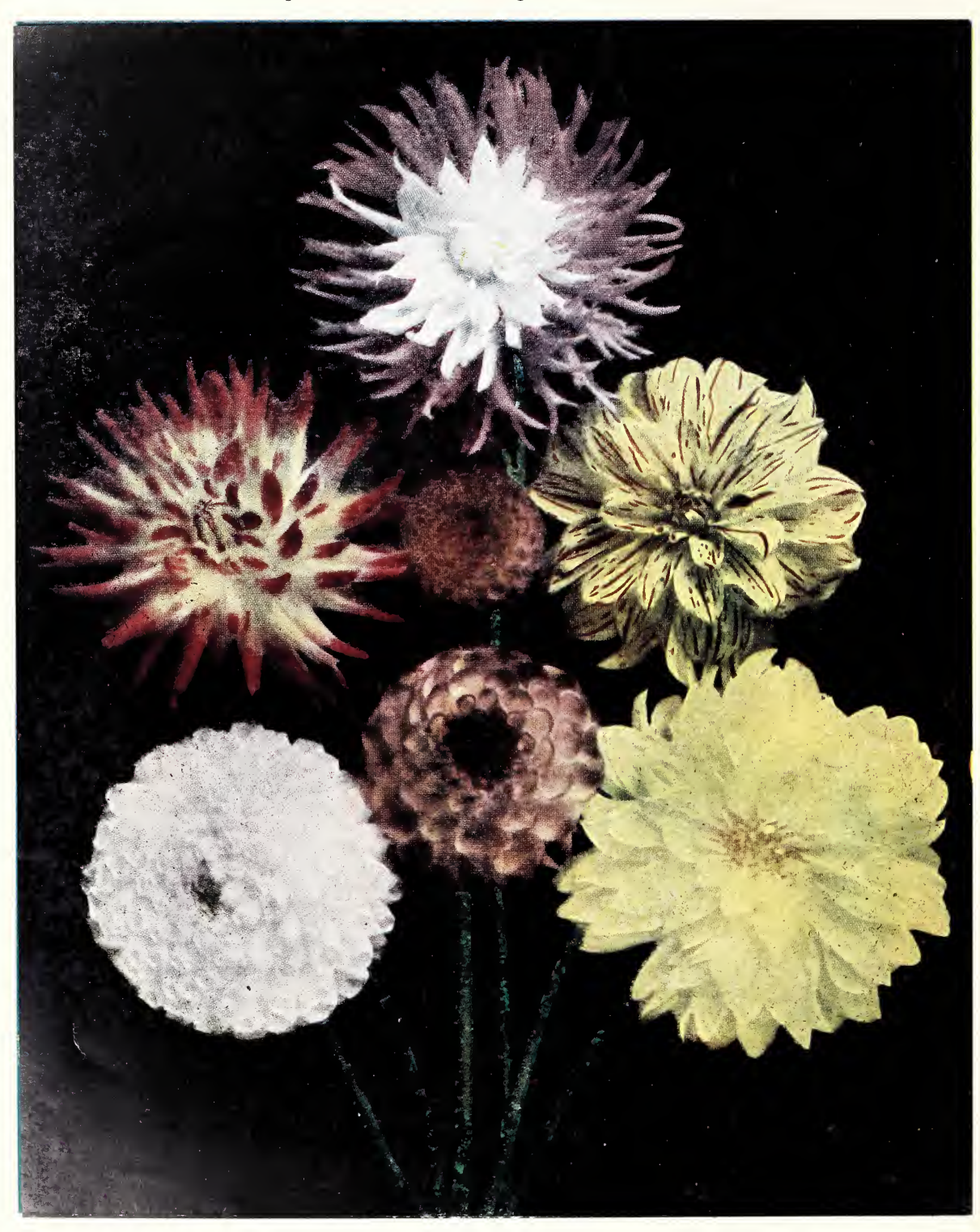
Middle Row— Bottom—