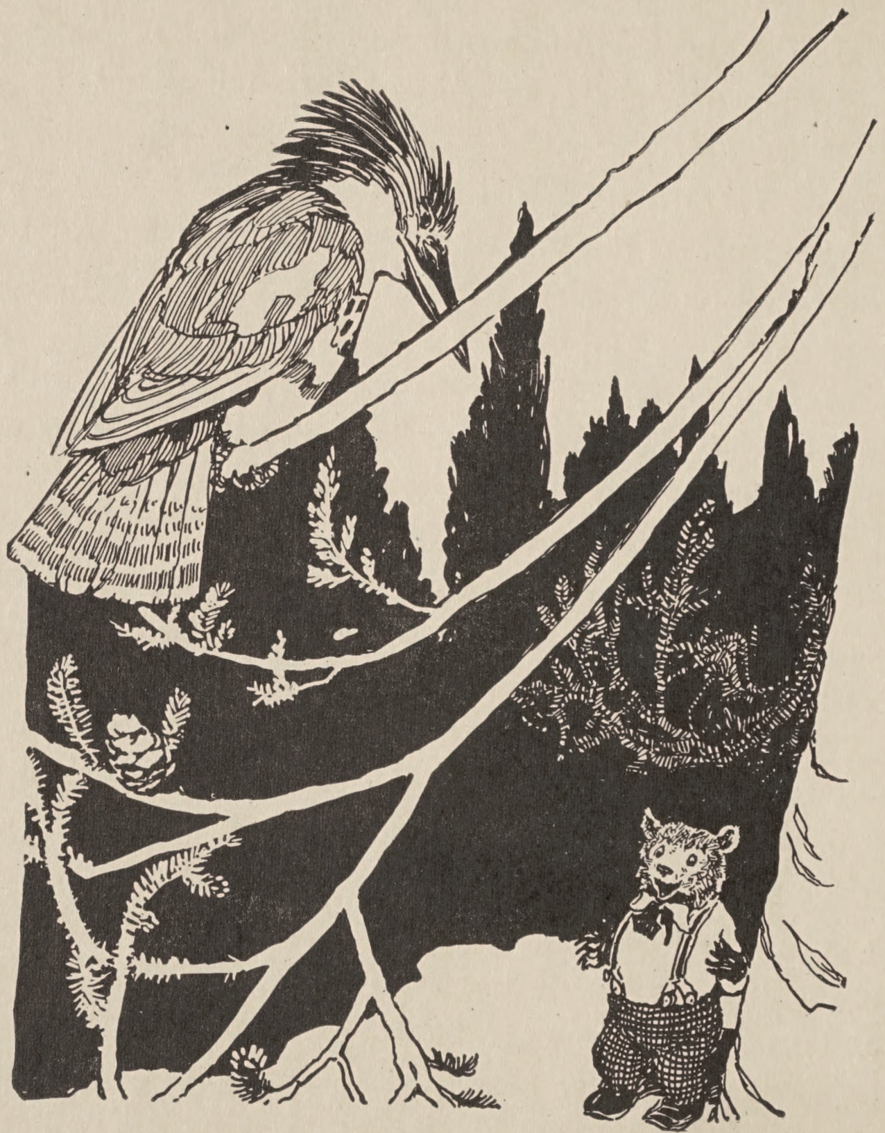
Father Kingfisher saw him