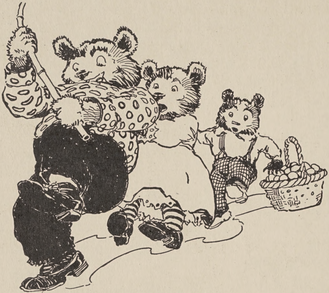
Back fell Father Bear

the raft, until suddenly Father Bear almost caught the fish. Up came the line, up bobbed the fish—a huge fish, almost the biggest fish Father Bear had ever caught. But back fell Father Bear, and bumped into Mother Bear, and she bumped into Little Bear, and he sat down in the basket of eggs, because the three were standing one behind another. Then the fish