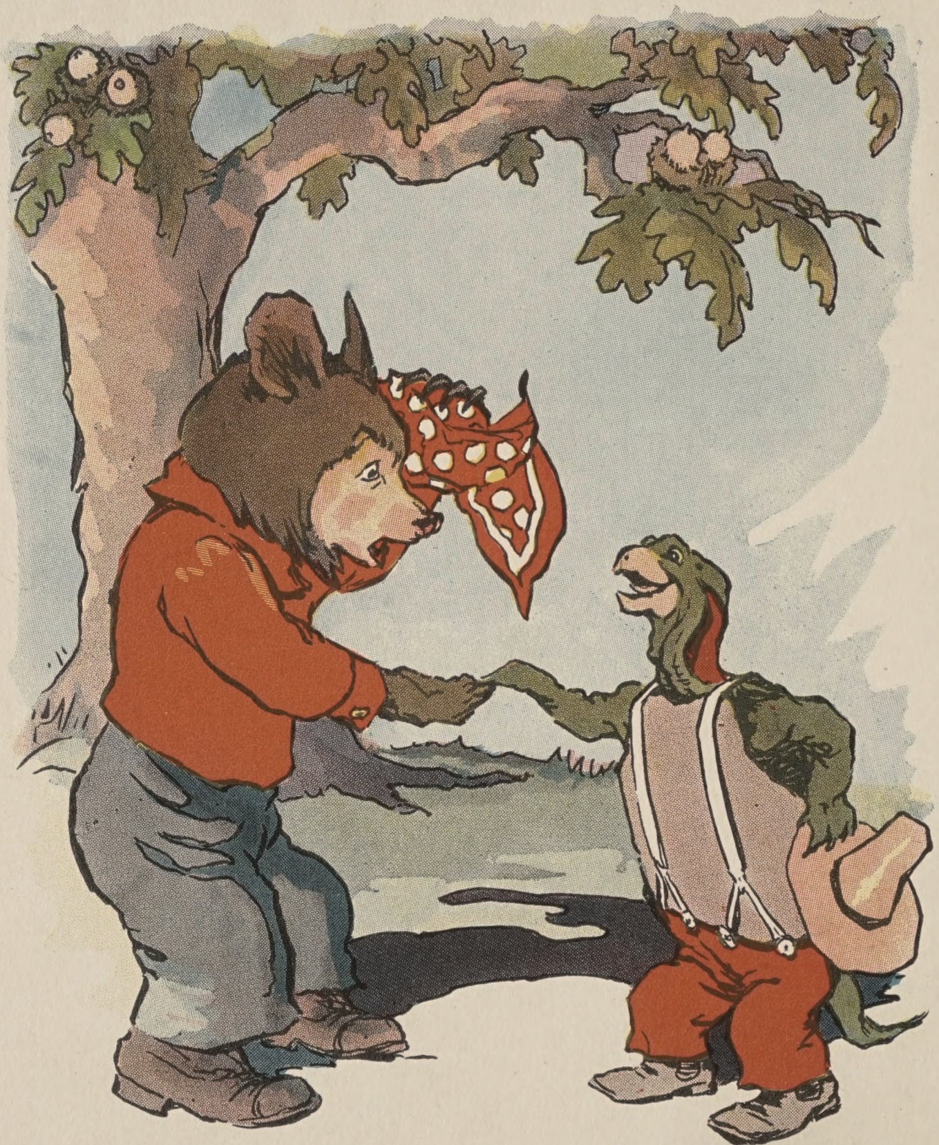
Little Bear walked up and shook hands with Grandpa Tortoise