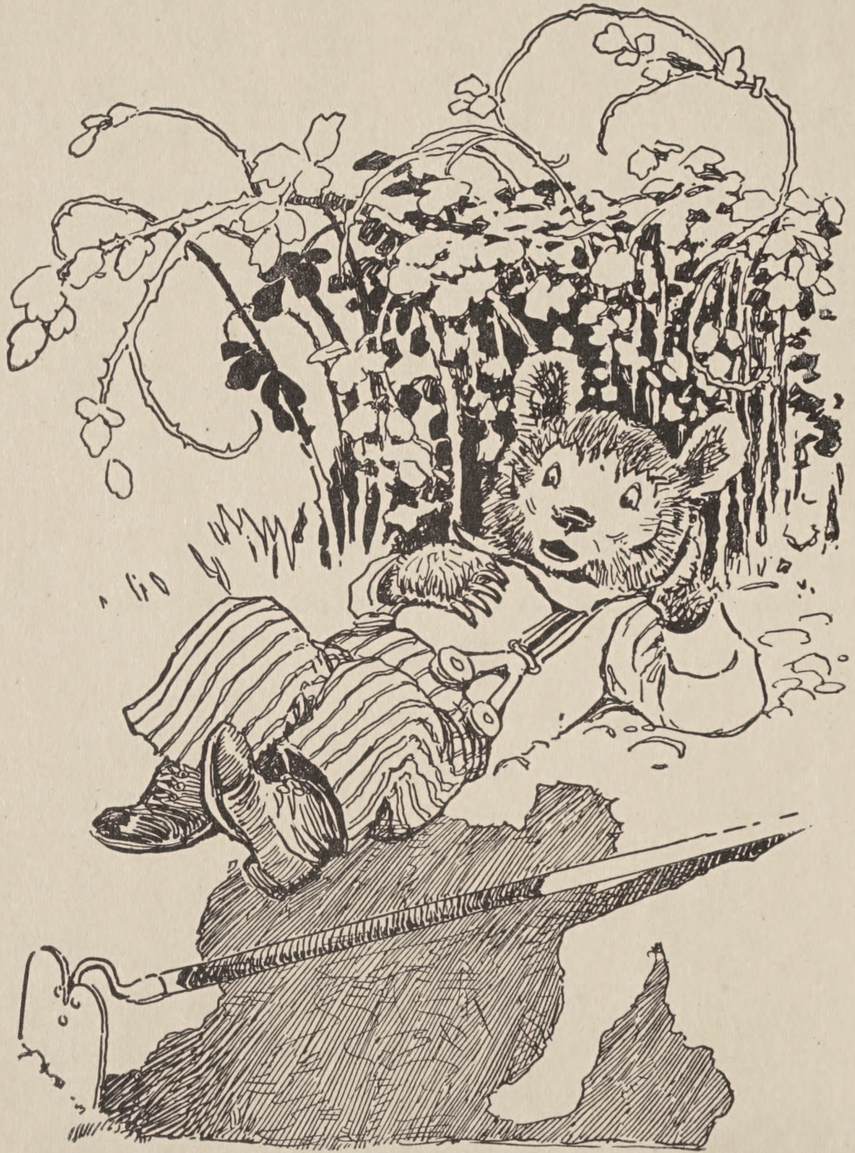
She found him lying on the ground