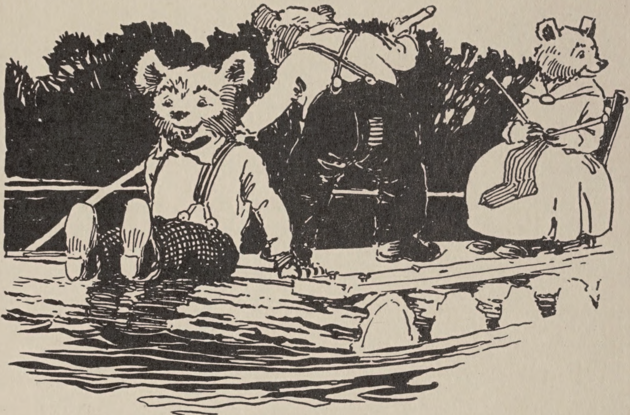
Father Bear took his family floating downstream

for a few minutes!” whispered Little Bear. “Let us watch the children!”