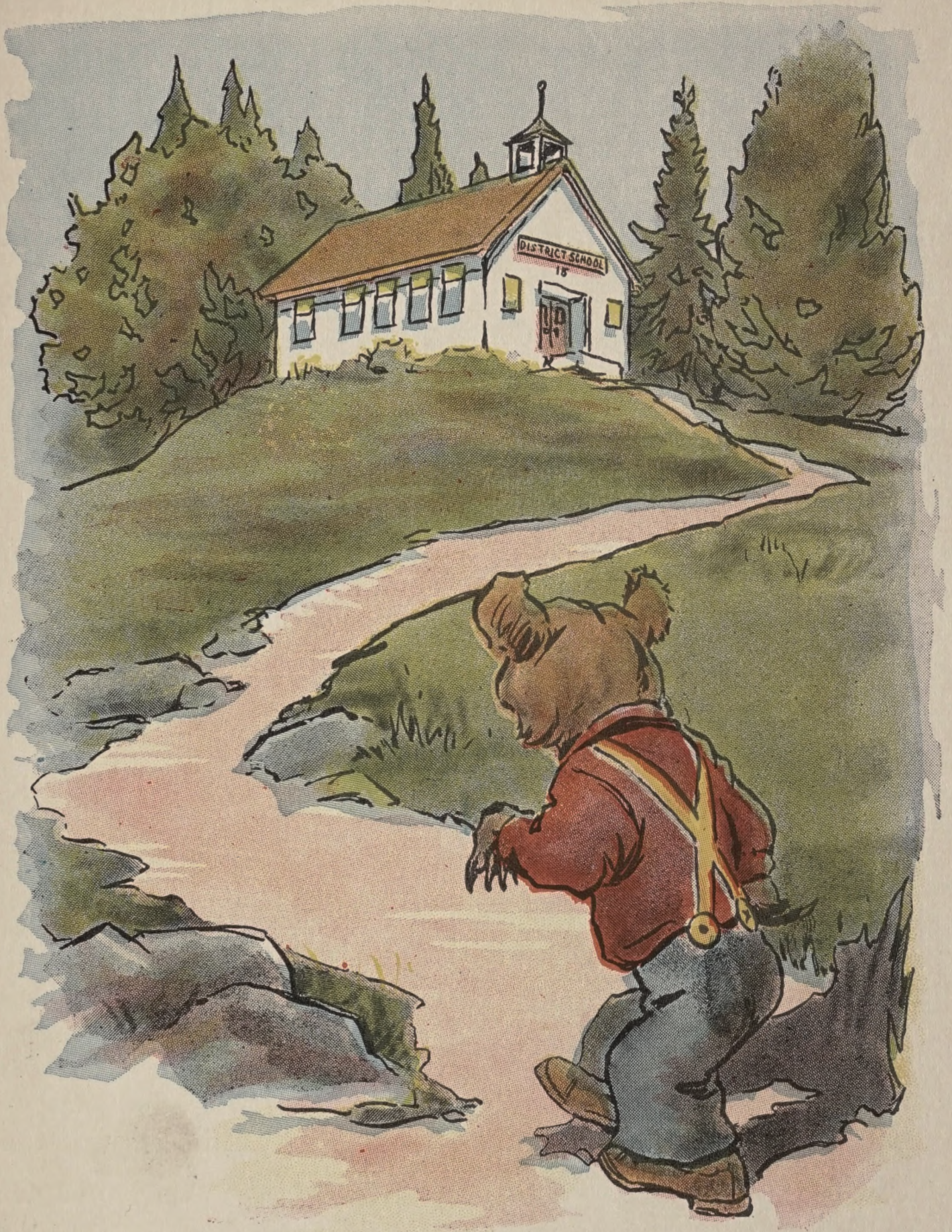
Little Bear crept softly up the path