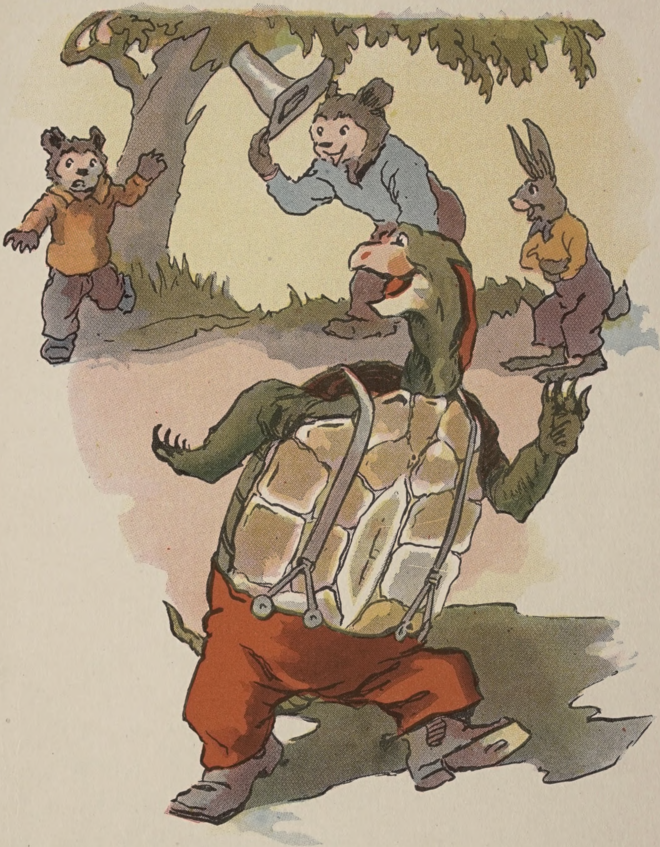
Grandpa Tortoise had reached his goal