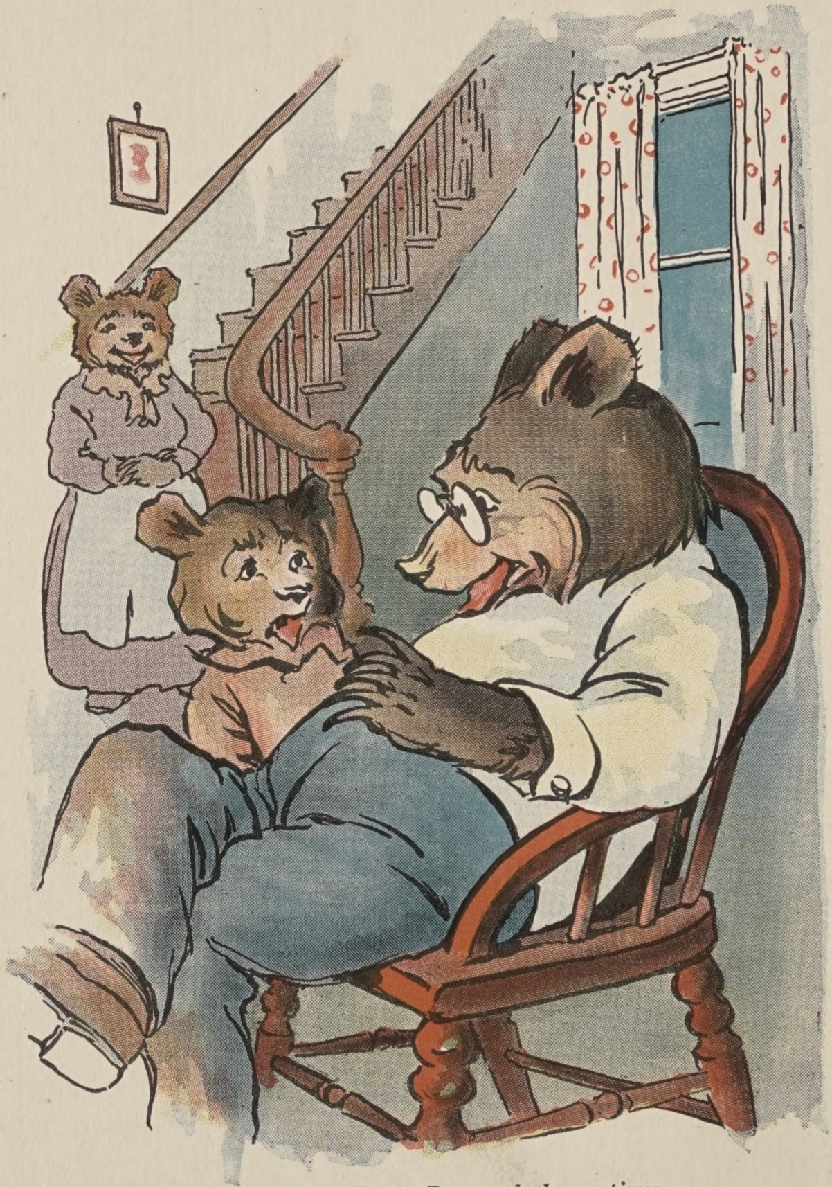
Between times Little Bear asked questions