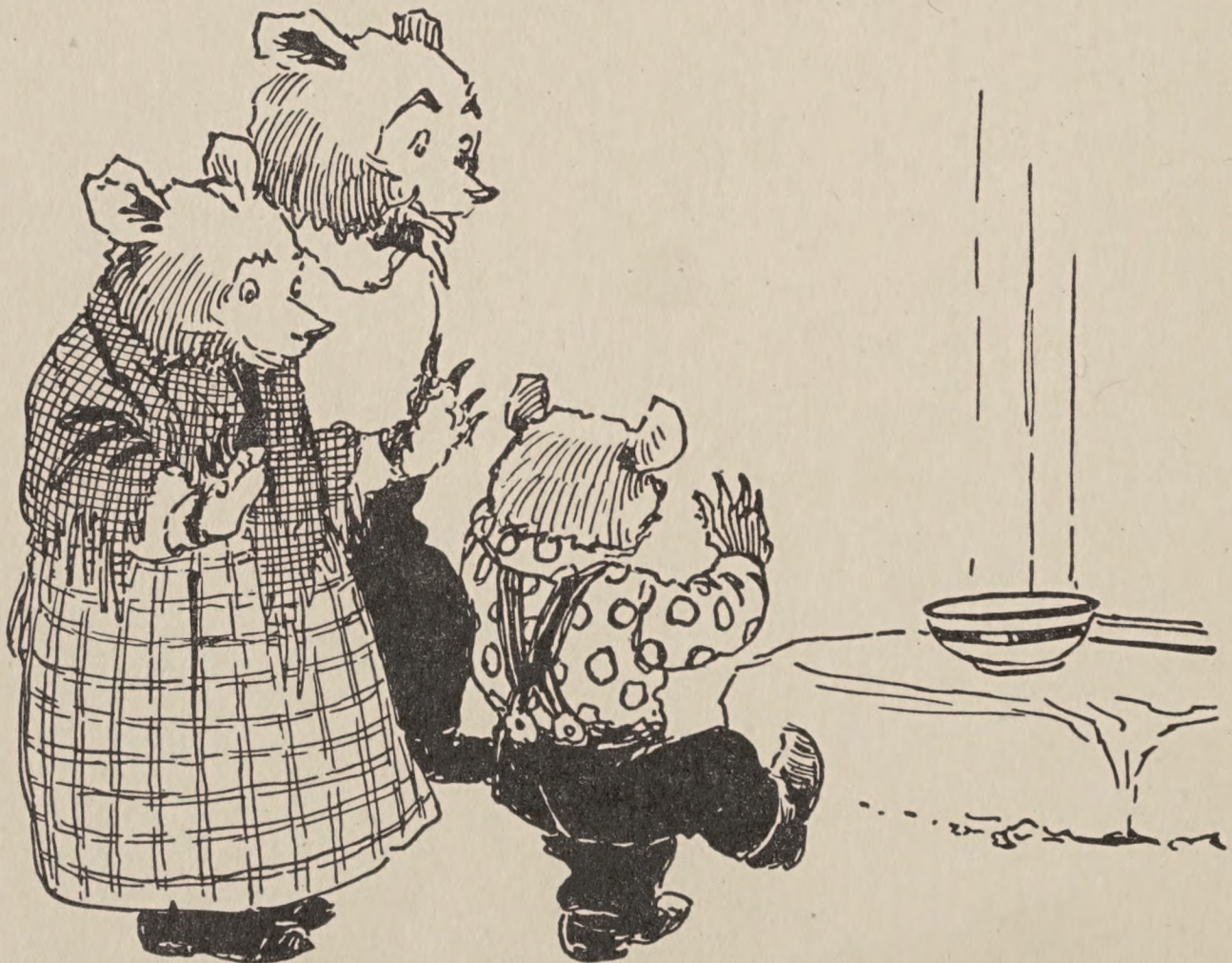
There was Little Bear's bowl on the doorstep

After Father Bear told Little Bear the story of Hamelin town he was more glad than ever that he had kept his promise. So was his mother. So was his father.