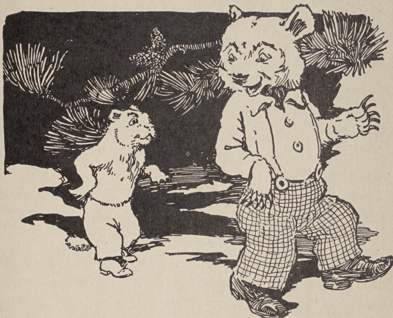
Baby Otter walked happily behind Little Bear

It happened that Father Bear had been teaching Little Bear how to follow the woods trails, and Little Bear knew the Otters' path, because they always went round stumps and under logs; besides, their legs were short and their bodies so heavy they left well-worn trails behind them.