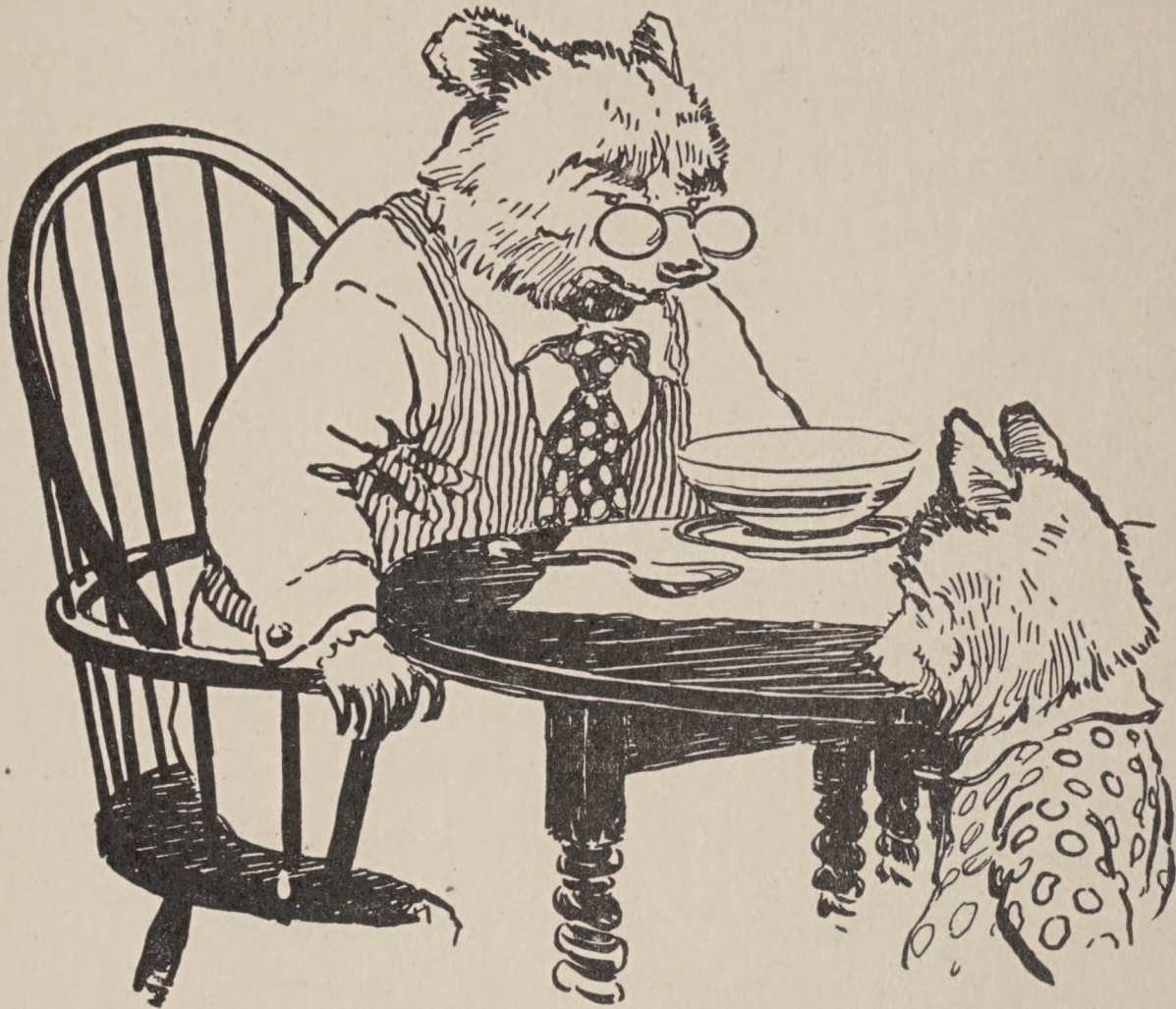
"I am hungry!" wailed Little Bear

of milk before he went out and weeded the blackberry patch. He was tired when he went to bed that night, and on many other nights afterward, but he said nothing about it, nor did he ever stop his work in the garden until he had done it all as well as he could. For he soon found out that when he had worked hard, even bread and water tasted good, but that when he had not worked, there was no taste in fish, or honey, or milk, or in a heaping dish of blackberries.