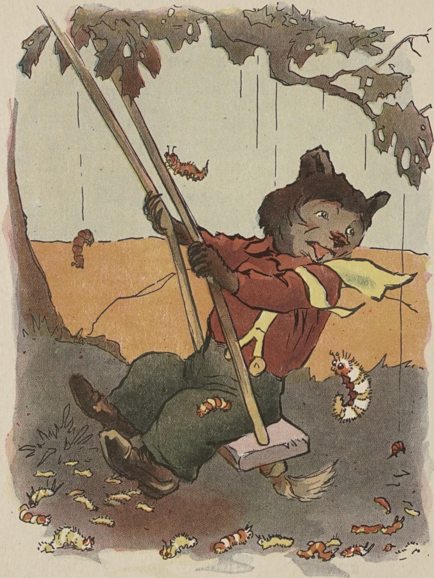
"Oh, you old humpty-humps"