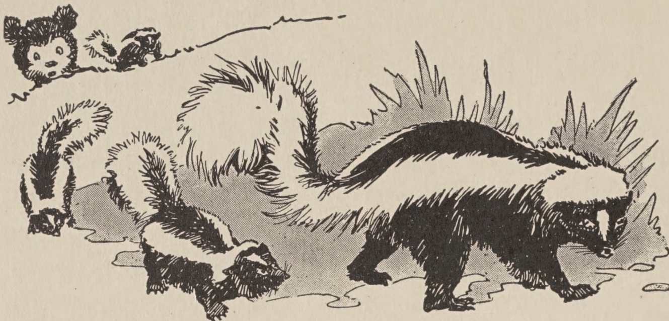
On walked Mother Skunk

stay here a while and catch beetles, but you must run along home. The men will not trouble you while we are in their path, never fear!”