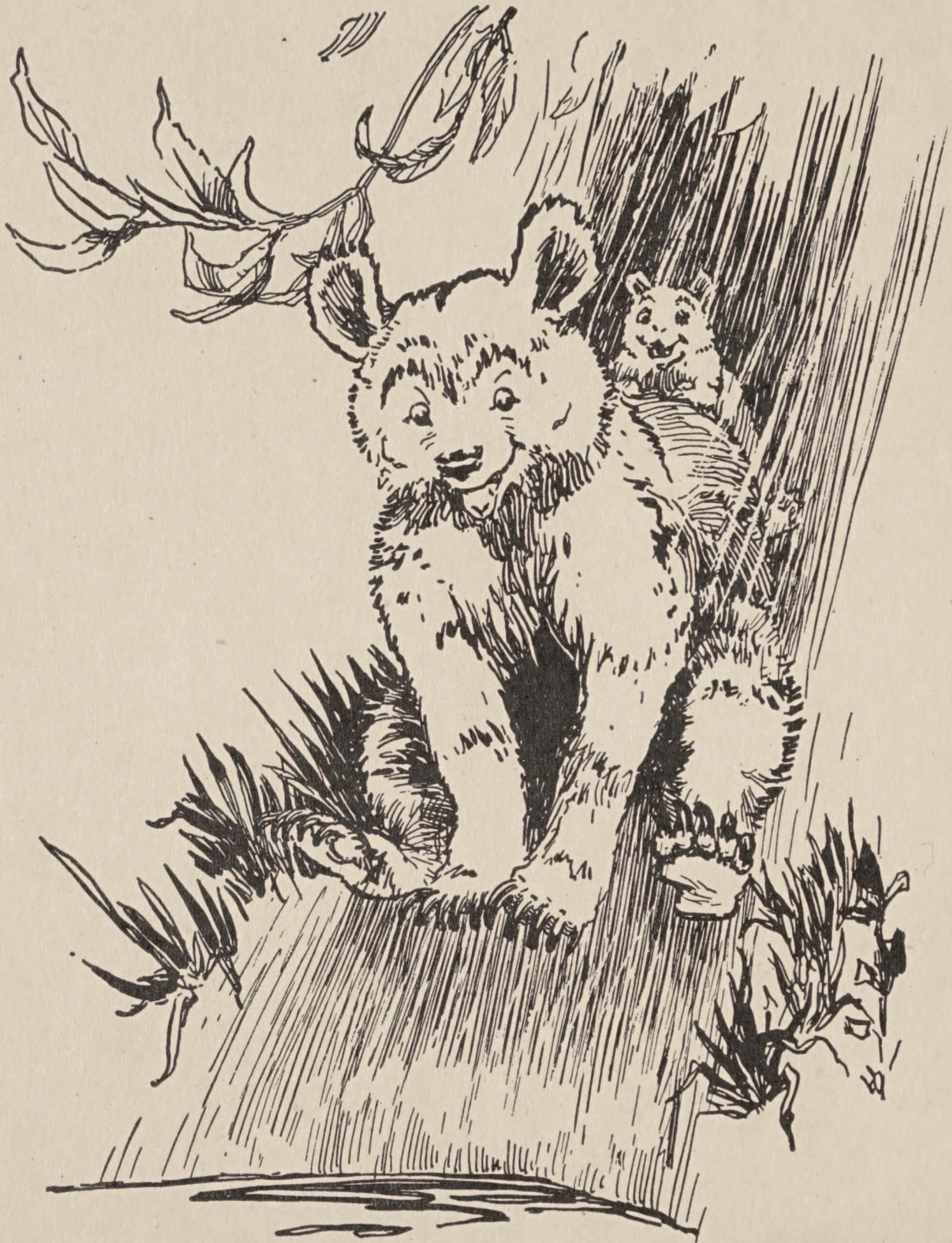
Little Bear was sliding down the Otters' toboggan slide