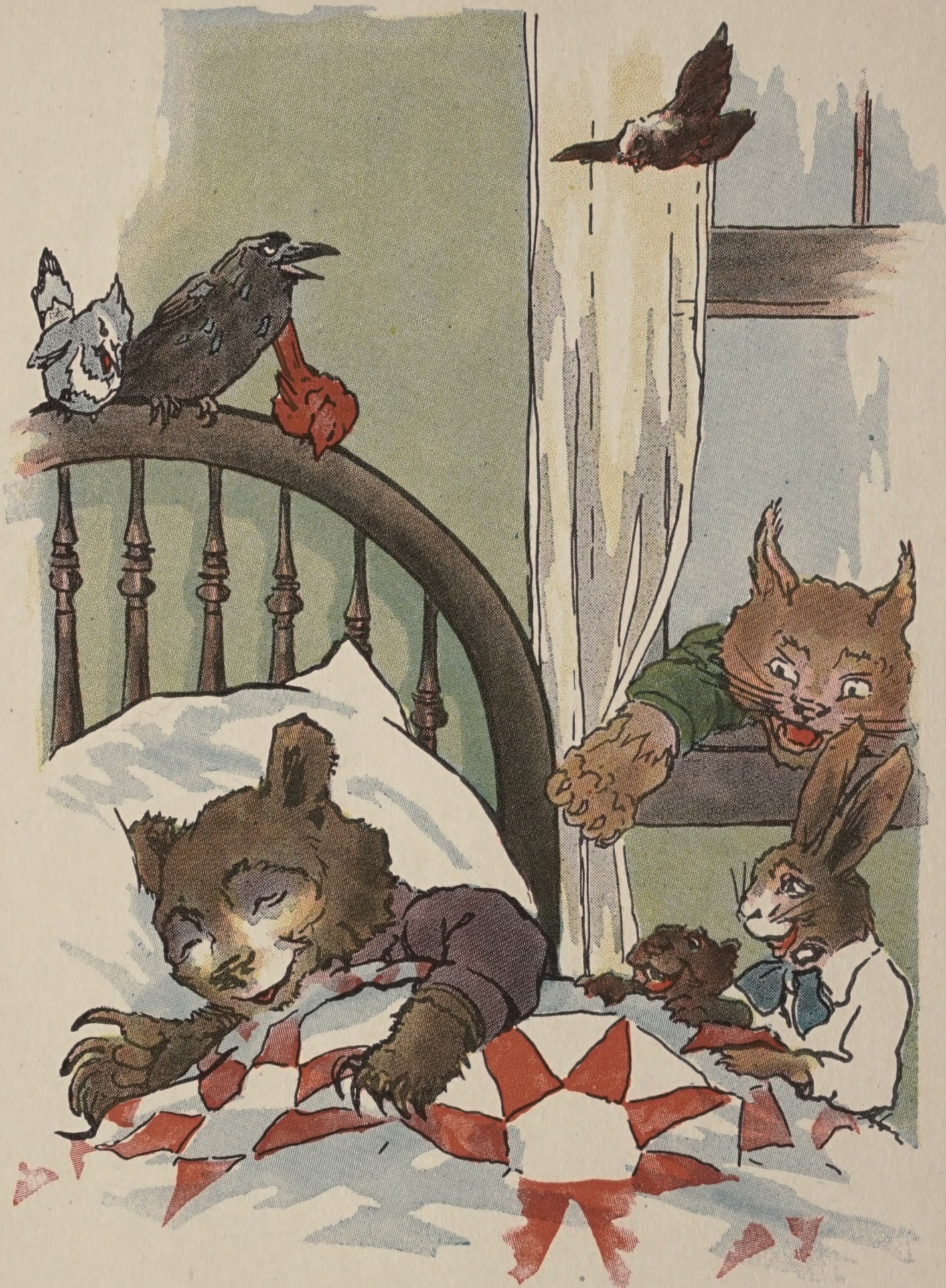
They found Little Bear sound asleep