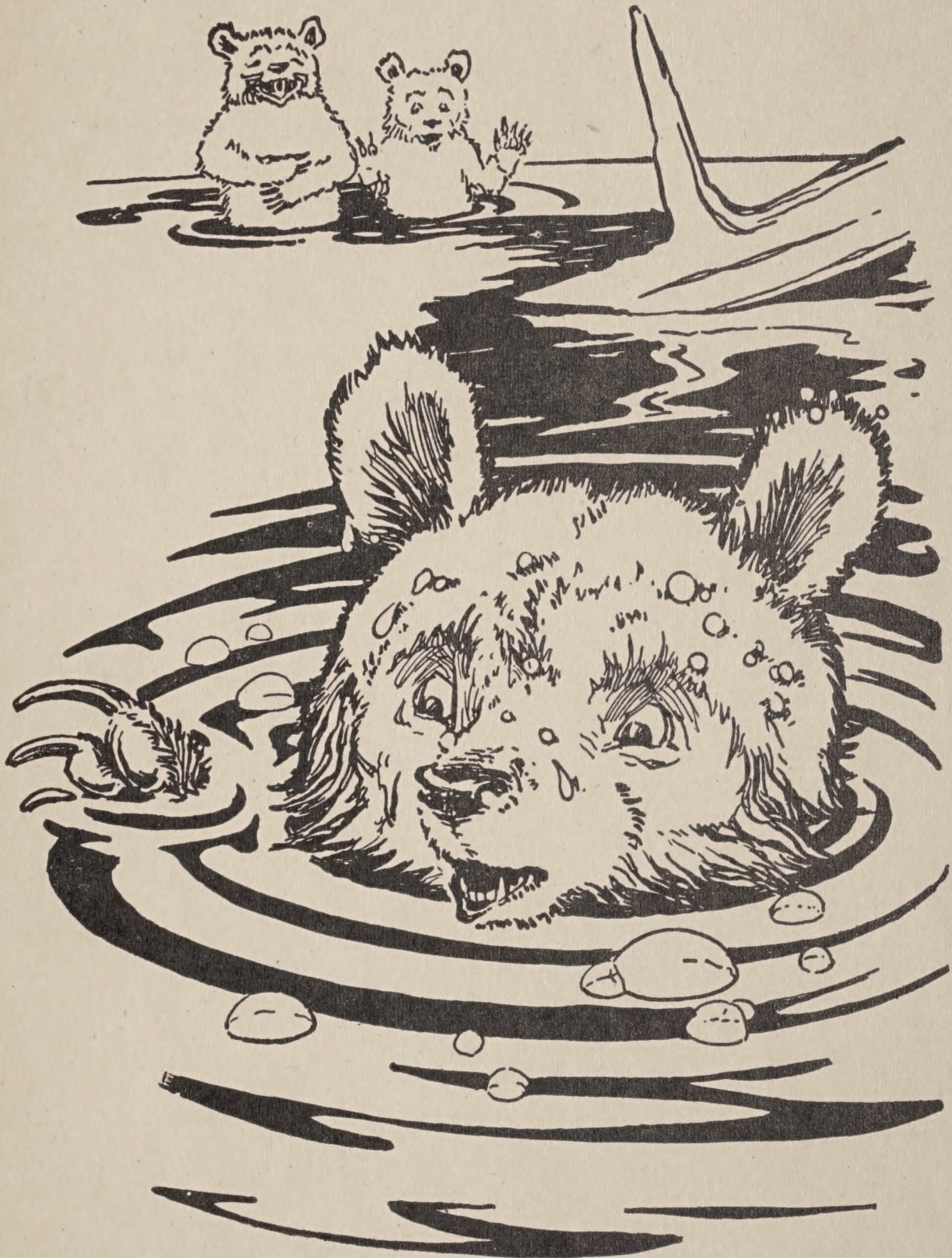
In a little while he bobbed up