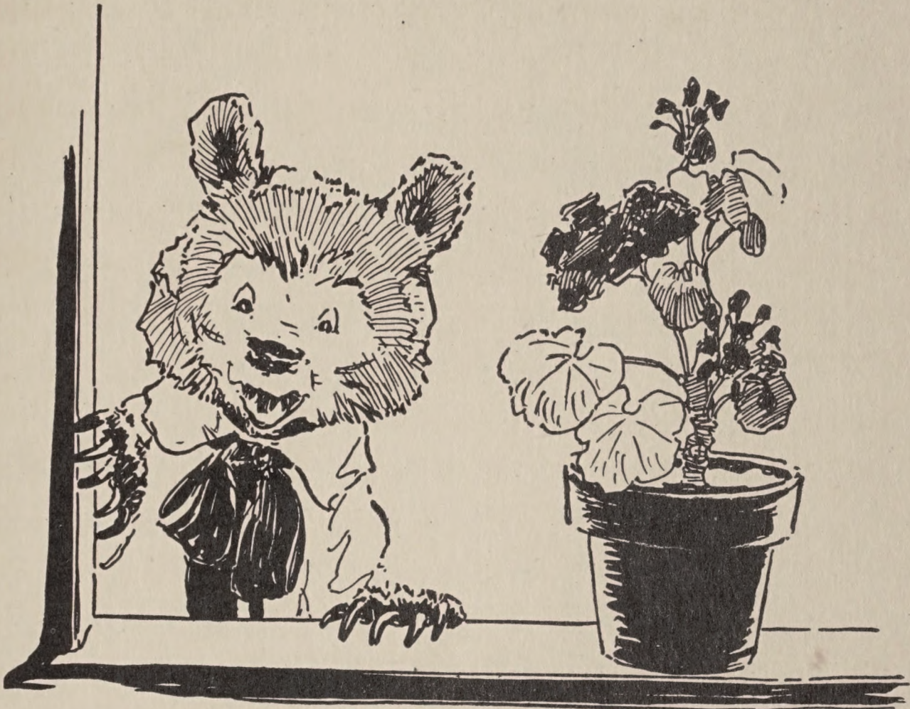
Little Bear leaned forward until his paws rested on the window sill

and then on the other and twisted and squirmed until the girls giggled.