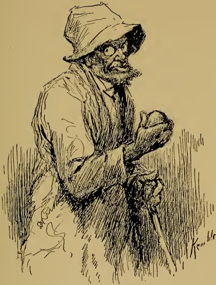
“Ol’ Marse Adam.”