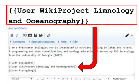
Figure 1: Joining WikiProject L&O as an editor

To stay up to date on the latest news and edit-a-thons, follow us on Twitter @WikiProjectLO, email us at <a href="wikiprojectlo@gmail.com">wikiprojectlo@gmail.com</a>, and find detailed tutorials at <a href="https://tinyurl.com/WikiProjectLO">https://tinyurl.com/WikiProjectLO</a>