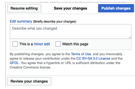
Figure 4: Summarize changes to any page prior to publishing