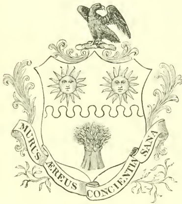
ARMS OF THE PEABODY FAMILY.