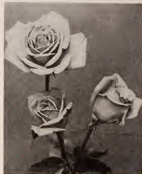
Pink Radiance Roses