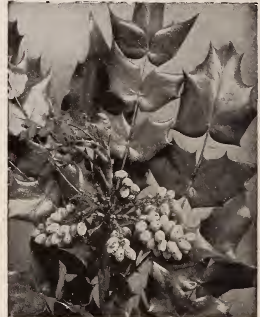
Mahonia or Hollygrape

PITOSPORUM, TOBIRA. A popular shrub for Southern planting. Compact habit of growth, dark green leaves clustered at the ends of the branches. Yellowish-white flowers in early Spring. Valuable for foundation planting. Price, $1.25 each. PYRACANTHA LALANDI. Dwarf growing shrub, slender branches. Foliage dark green, white flowers borne in clusters followed by orange colored berries. Price, $1.25 each.