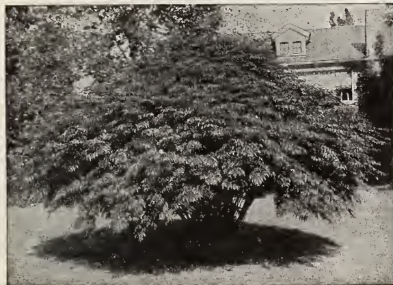
Texas Umbrella Tree

WEeping MULBERRY. Small tree of drooping habit of growth. Long, graceful branches curving to the ground. Fine for specimen planting. Price, Two-year heads, $1.75 each.