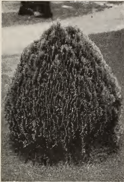
Dwarf Golden Arbor-Vitae