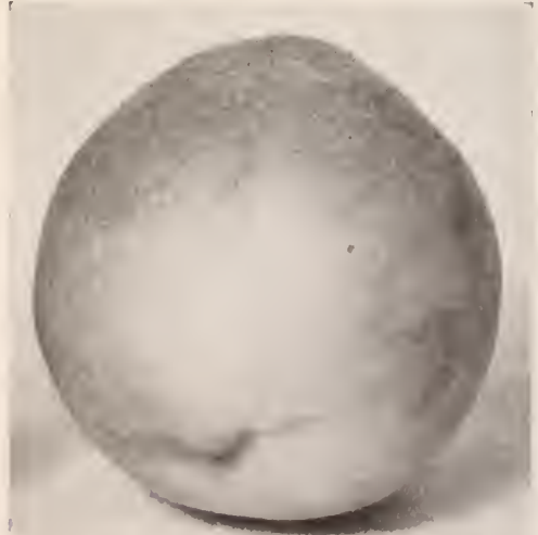
Belle of Georgia Peach

4 to 5 feet, 35c each; $3.00 per 10. 2 to 3 feet, 20c each; $1.50 per 10; $12.50 per 100. MAYFLOWER. Medium size, red skin, firm flesh. Freestone. EARLY ROSE. Early. Fruit fair sized, highly colored. Cling.