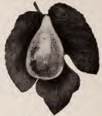
Brown Turkey Fig

4 to 5 feet, 60c each; $5.00 per 10. HICKS. Most popular of all. Fruit black, sweet and well flavored.