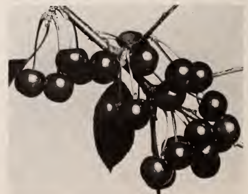
Early Richmond Cherries

3 to 5 feet, 50c each; $4.50 per 10. 2 to 3 feet, 40c each; $3.50 per 10; $30.00 per 100. GOVERNOR WOOD (Sweet). Medium size, pale yellow with pink flush. EARLY RICHMOND (Sour). Medium size, bright red. Ripens last of May. LARGE MONTMORENCY (Sour). Larger than Early Richmond and ripens about ten days later. Bright red. BLACK TARTARIAN (Sweet). Fruit large, black, heart-shaped.