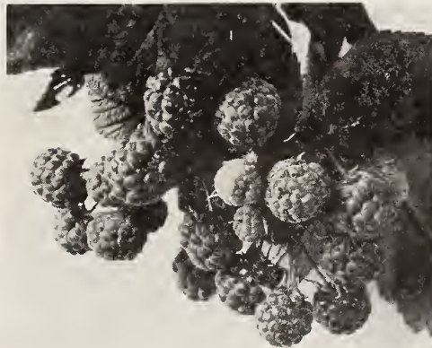
St. Regis Raspberries

PRICES: 70c per 10; $6.00 per 100 EARLY HARVEST. Extra early. Medium sized berries of good quality. ELDORADO. Large, sparkling black fruit. Very sweet.