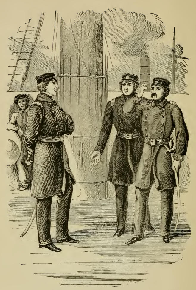
Somers and the Admiral. Page 202.