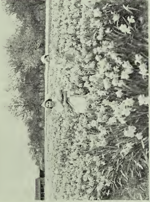
Gronen Daffodil Gardens Puyallup, Washington