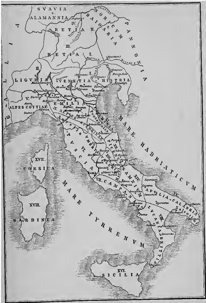
THE PROVINCES OF ITALY ACCORDING TO PAUL THE DEACON. Kiepert Neus Archiv. V, p. 104.