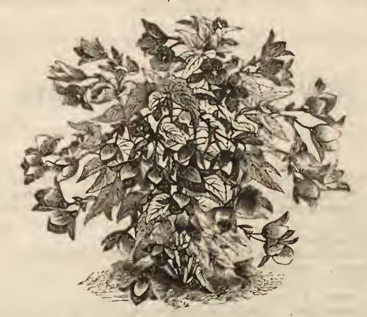
NEW TUBEROUS-ROOTED OR BEDDING BEGONIAS.

Rhomboidea. Leaves dark, rich green, with a bronze hue. Price, 50c. each.