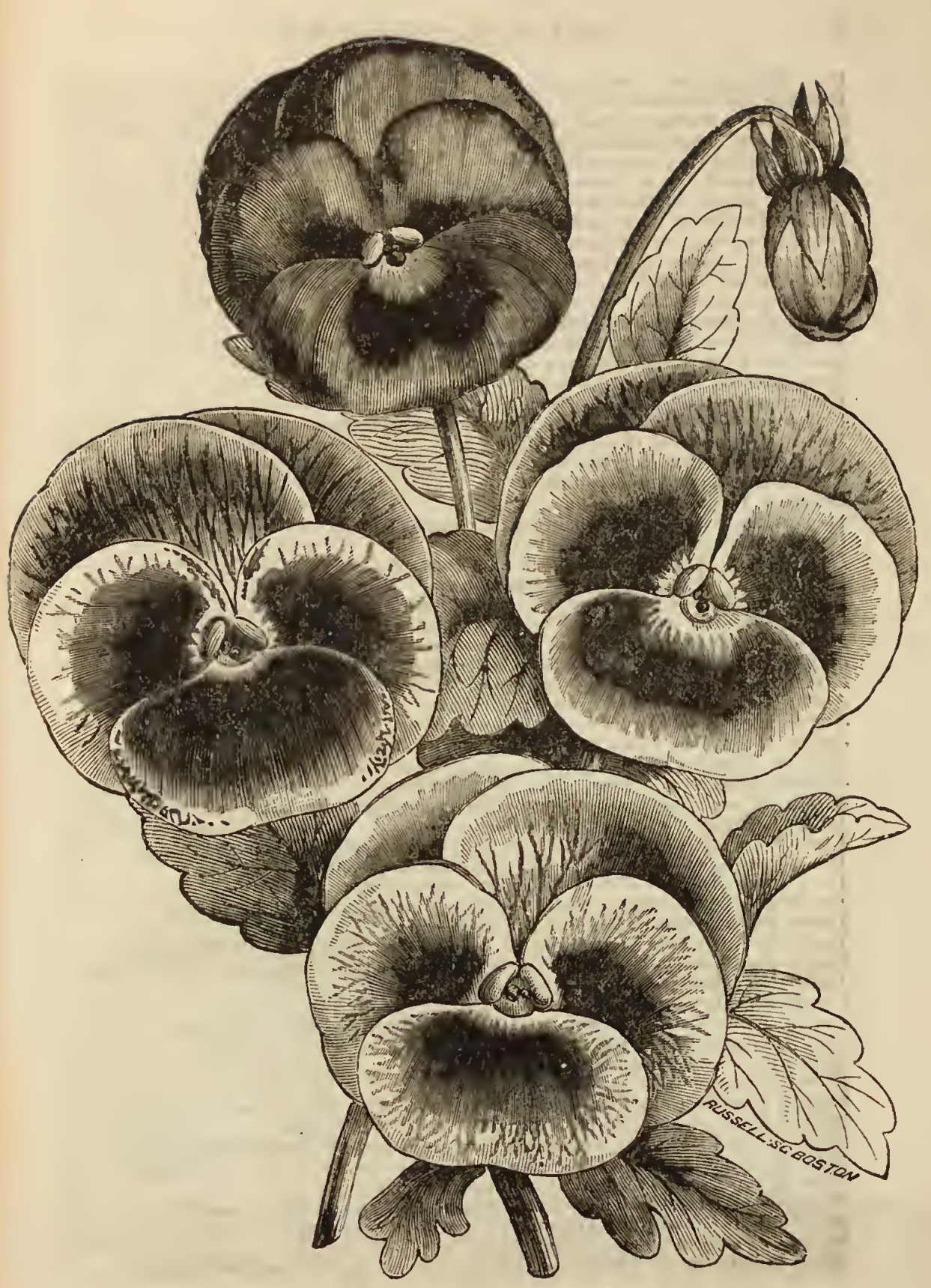
LARGE ENGLISH PANSIES. See page 54.