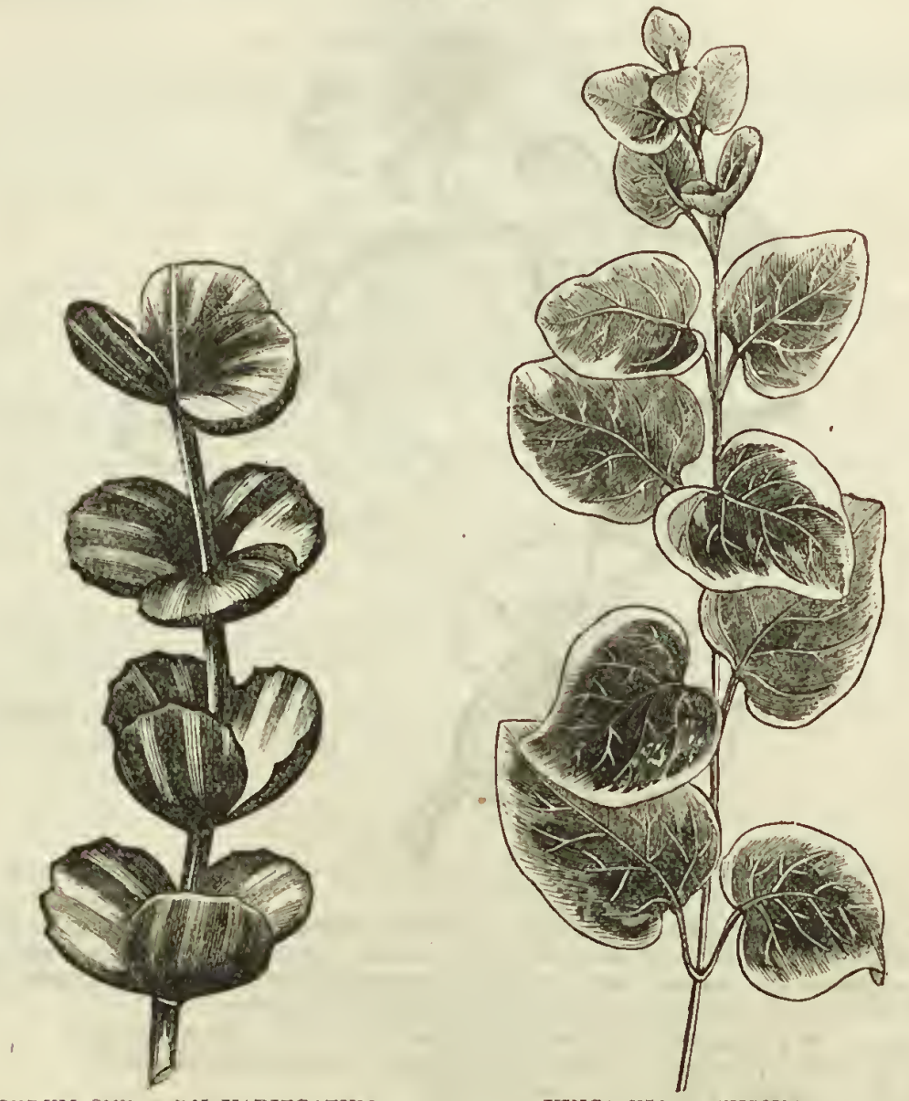
SEDUM SIEBOLDII VARIEGATUM.

Minor variegata, handsomely variegated; foliage hardy. Price, 25c. each; $2.25 per dozen.