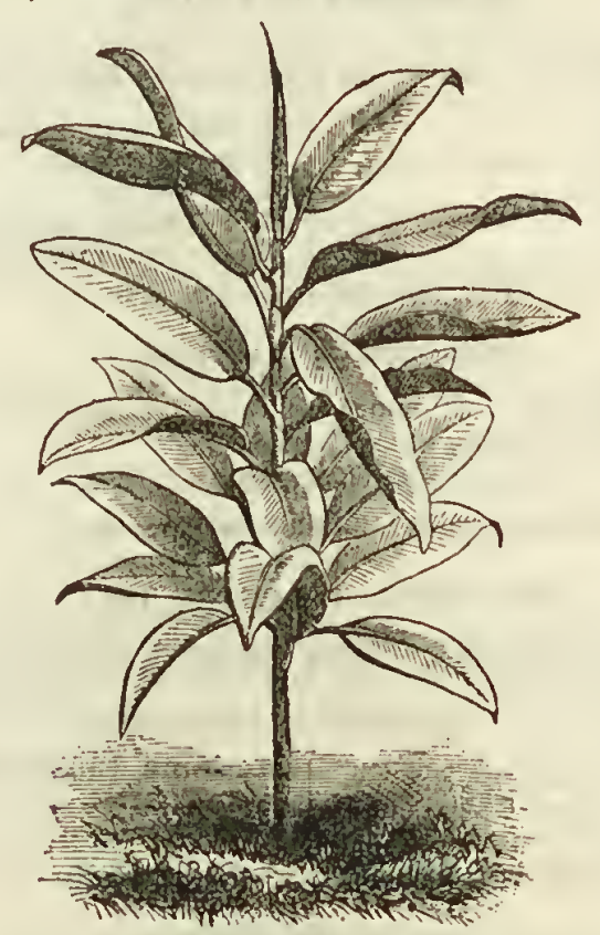
FICUS ELASTICA (INDIA RUBBER TREE).

Eranthemum Andersoni. 30e. pulchellum, 50e. Euphorbia splendens, 50e. Eugeni Ugni, 50e.