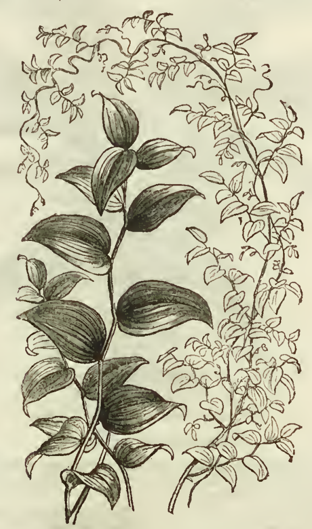
MYRSIPHYLLUM OR SMILAX.

One of the most delicate and beautiful of all winter climbing plants, growing rapidly, and covering a wall or trellis in a few weeks. The foliage is small, smooth, and glossy, and for bouquets or wreaths, or for table decoratiou, surpasses every other plant. Price, 20c. each; $2 per dozen; $15 per hundred.