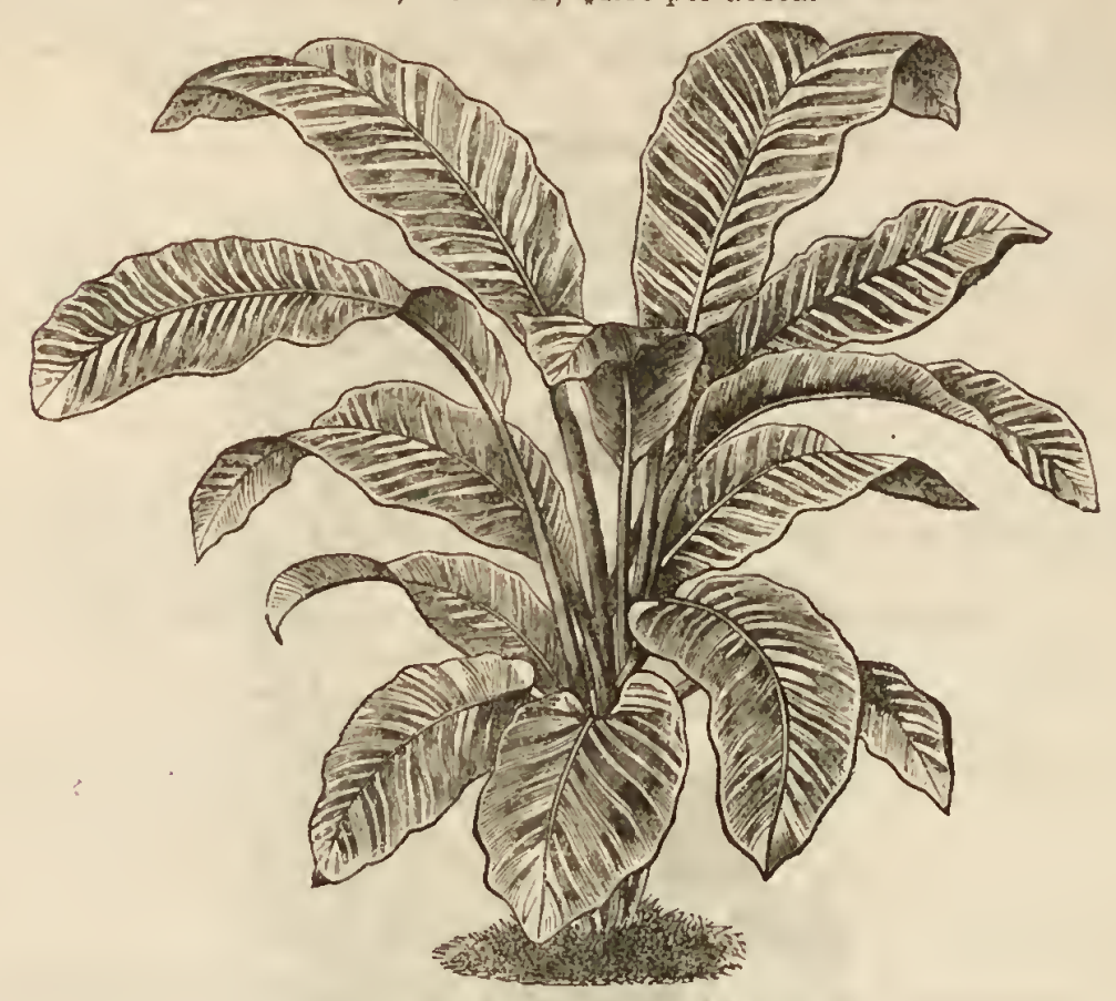
MARANTA ZEBRINA. (See page 34.)

A very rapid-growing and pretty elimbing plant, with fleshy leaves, eovered with spikes of feathery flowers, with the delicate fragrance of Mignonette. Price, 15e. each; $1.50 per dozen.