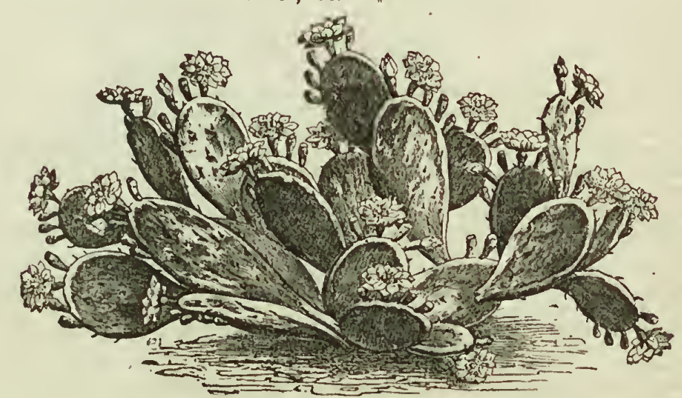
Opuntia Rafinesquina. A hardy species of Caetus.