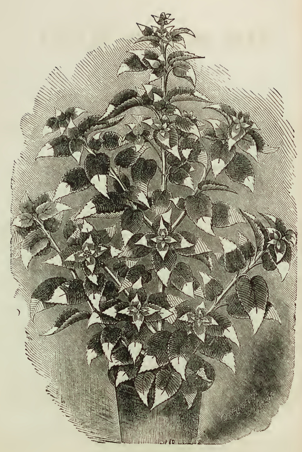
COLEUS, LADY BURRILL.