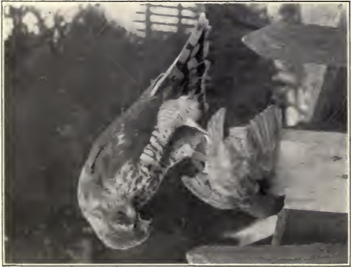
SPARROW HAWK (page 49)