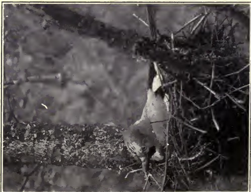
JAY ON NEST ( page 61 )