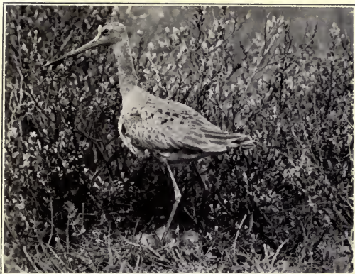
REDSHANK ( page 119 )