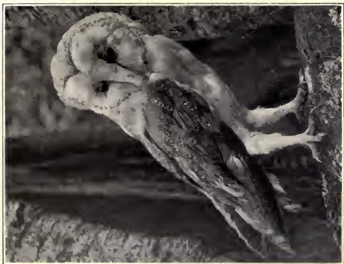
BARN OWL ( page 32 )