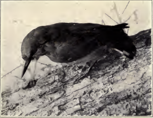
NUTHATCH (page 48)