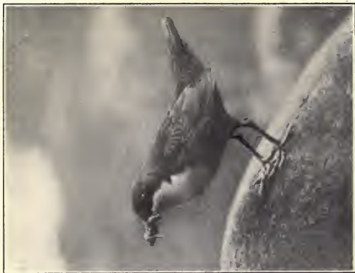
DIPPER (page 80)