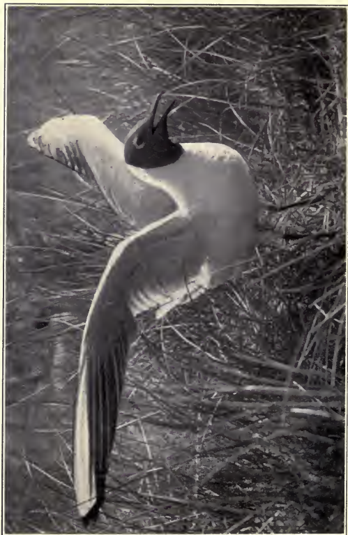
BLACK-HEADED GULL—Very Angry (See page 112)