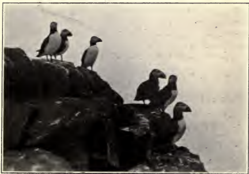
PUFFINS ( page 103 )