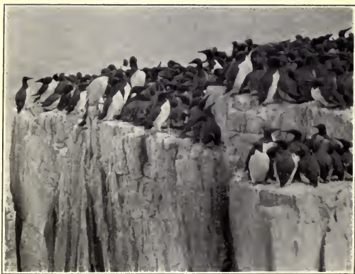
GUILLEMOTS ( page 120 )