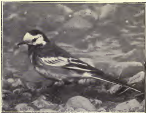
WAGTAIL ( page 22 )