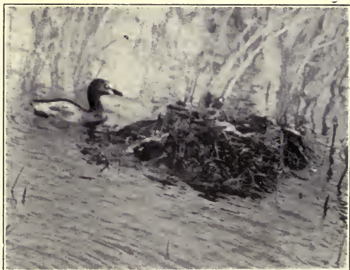
LITTLE GREBE ( page 87 )