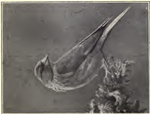
LINNET ( page 70 )