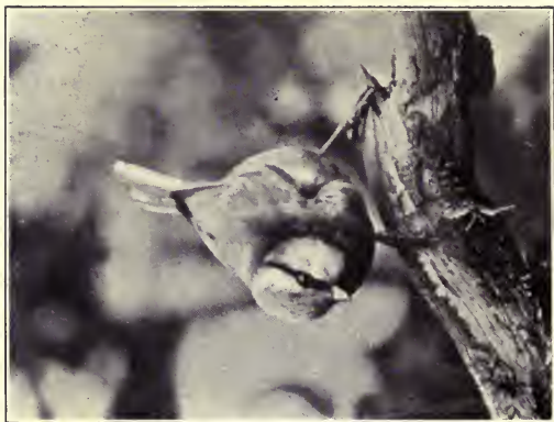
BLUE TIT ( page 41 )