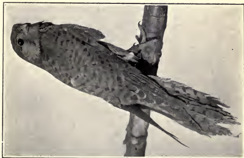
KESTREL ( page 33 )