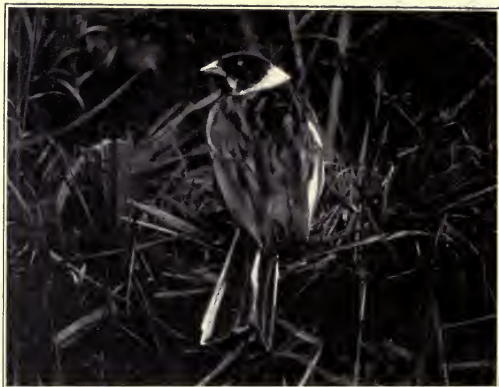
REED BUNTING ( page 84 )