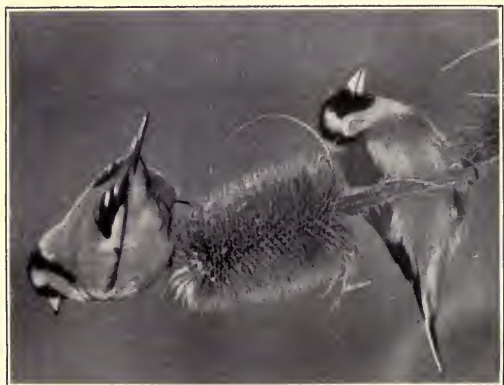
GOLDFINCHES ( page 41 )