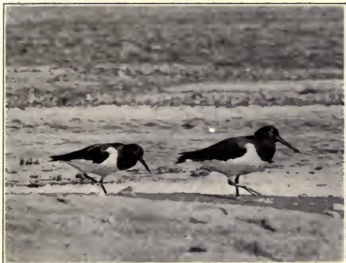
OYSTER CATCHER ( page 101 )