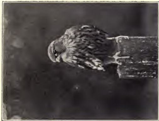
MERLIN ( page 67 )