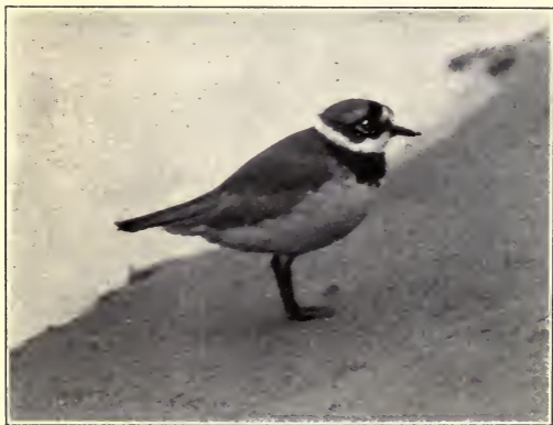
RINGED PLOVER ( page 117 )