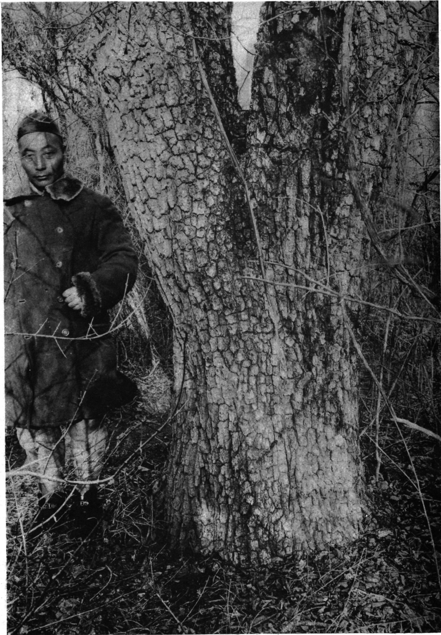
OLD TRUNK OF THE BLIGHT-RESISTANT PEAR.