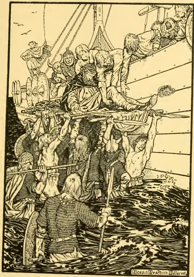
The dying King Hakon carried to his Ship