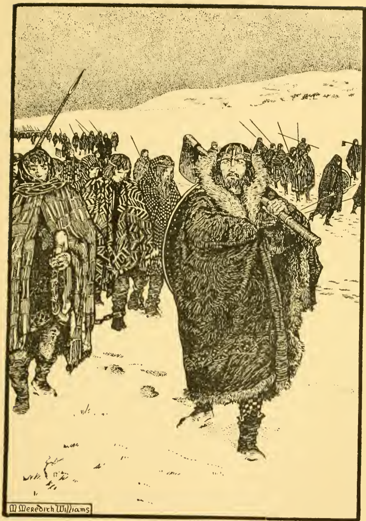
Murtough on his Journey with the King of Munster in Fetters 118