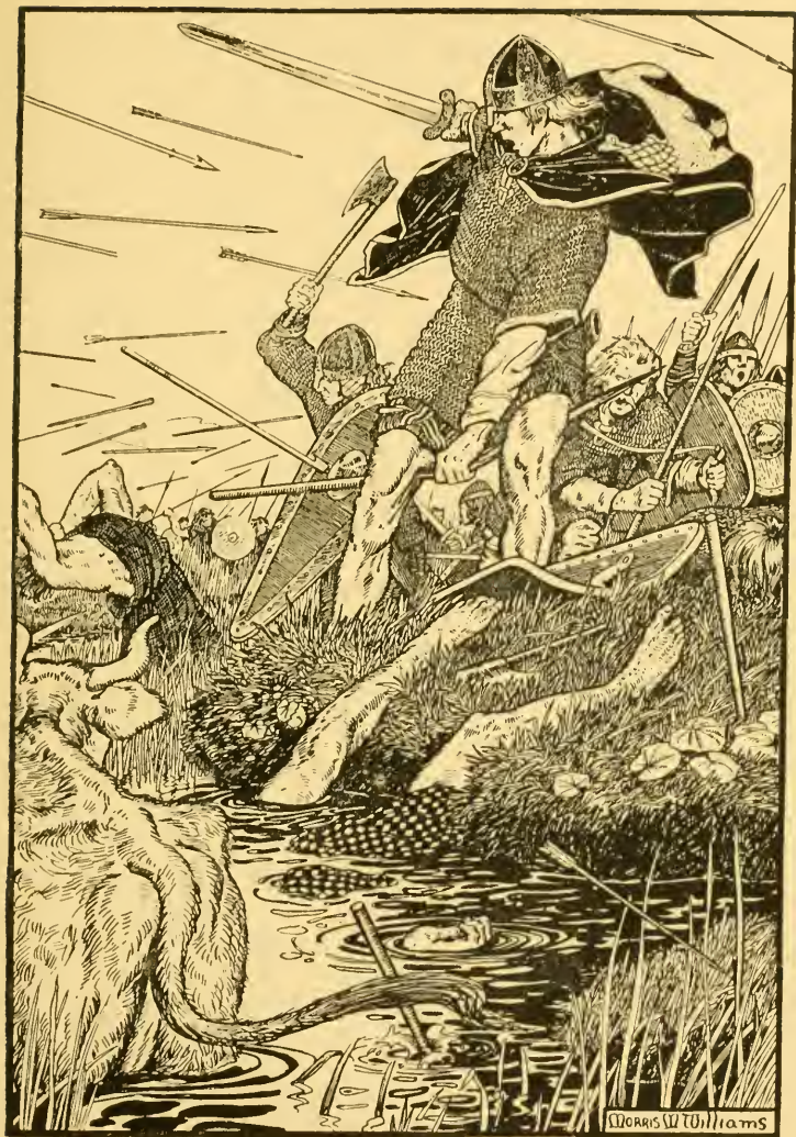
King Magnus in the Marsh at Downpatrick