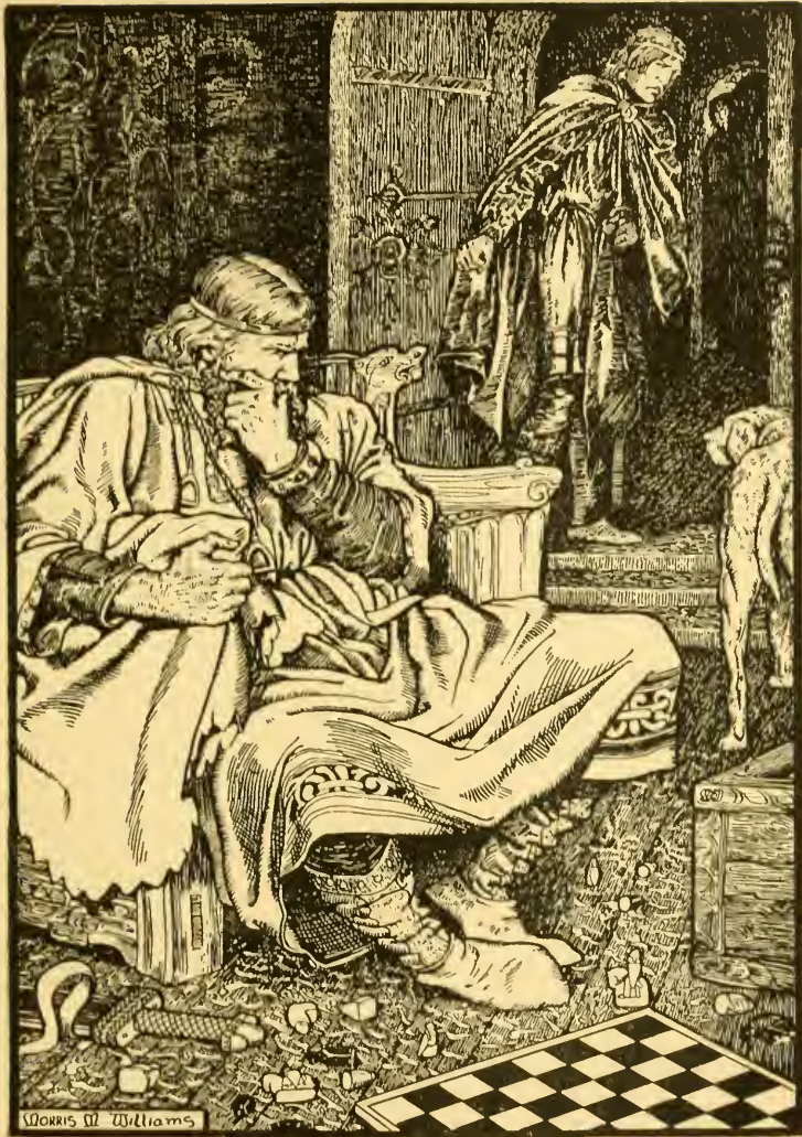
King Canute und Earl Ulf quarrel over Chess