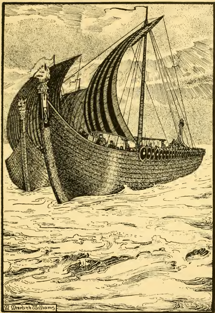
King Olaf's "Long Serpent"