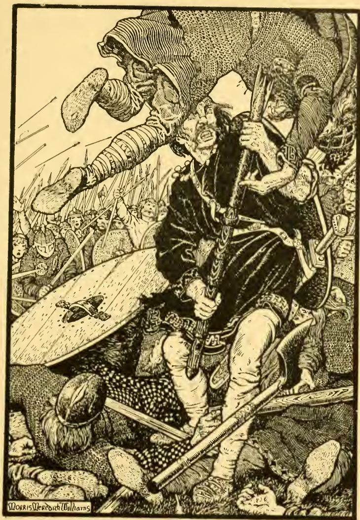
Thorolf slays Earl Hring at Brunanburh