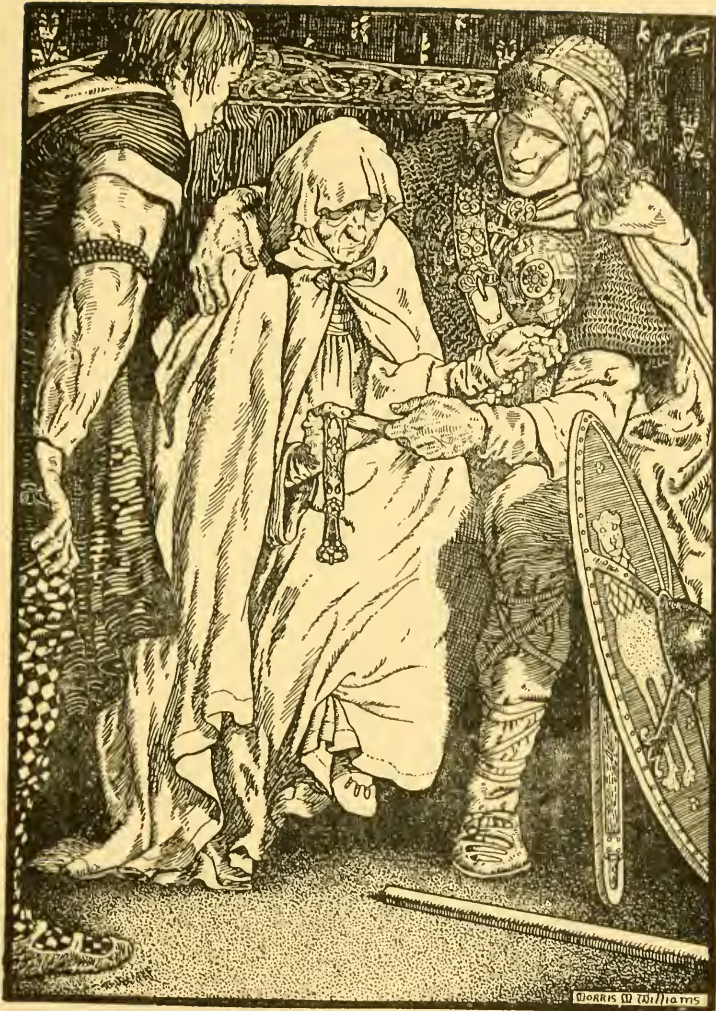
Olaf took the Old Woman in his Arms