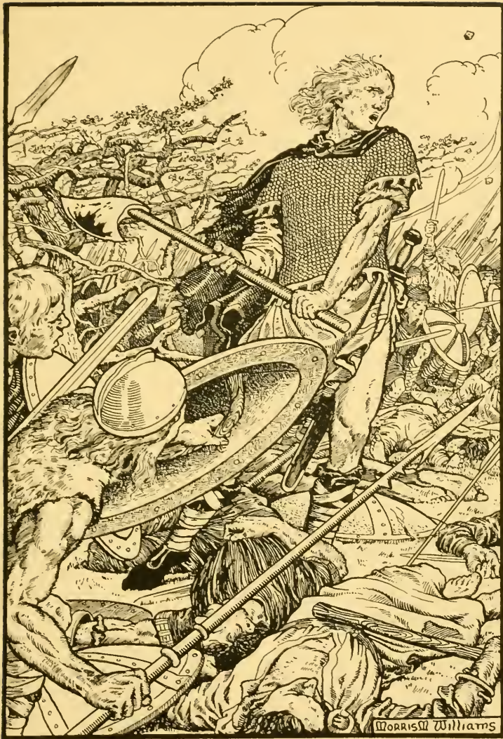
Alfred at Ashdune