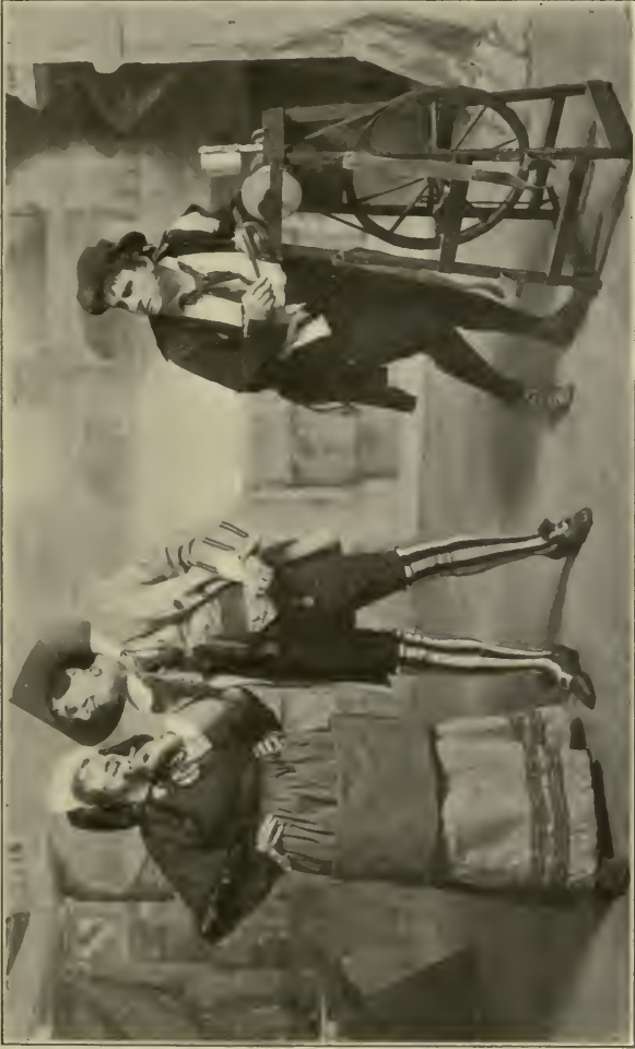
“The old woman gazing at him in admiration.”