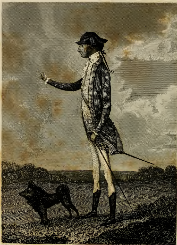
MAJOR GEN L CHARLES LEE.