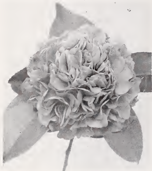
Camellia Prof. C. S. Sargent