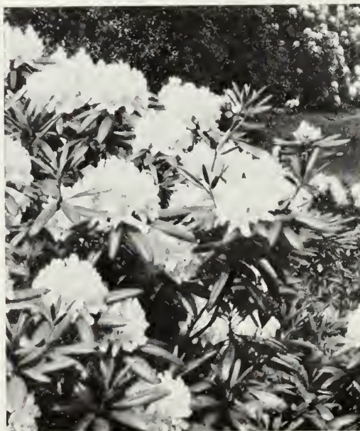
Rhododendrons—shrubs of lasting beauty