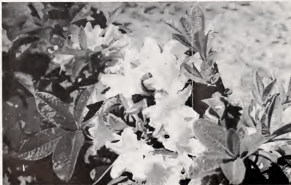
Beautiful color, long-blooming season make Azaleas ideal for your garden.