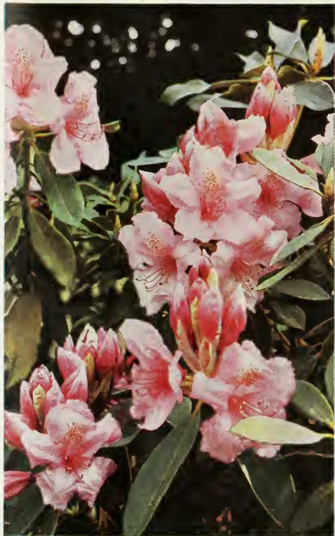
Rhododendrons are a beautiful part of any landscape