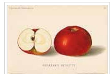
la manzana roja – the red apple