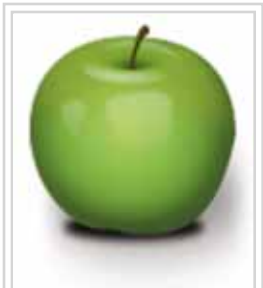
la manzana verde – the green apple