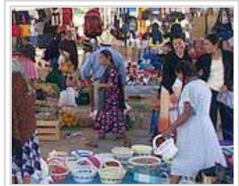
el tianguis – the Mexican market