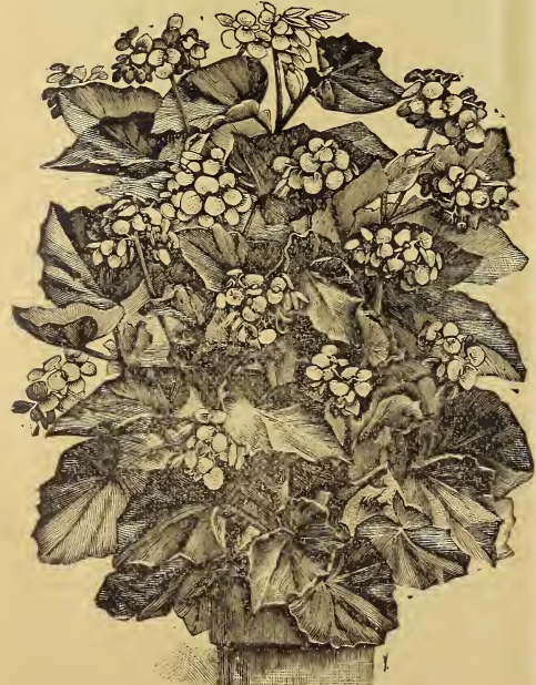
BEGONIA SEMPERFLORENS ELEGANS.

This fine new variety attains a height of twelve to fourteen inches, and is a compact mass of medium sized, glossy, olive green leaves. It blooms continuously, and is so free as to present the appearance of a huge bouquet. The flower is a rosy flesh color shaded with bright rose, enlivened with dense clusters of yellow anthers. $1.75 per doz.