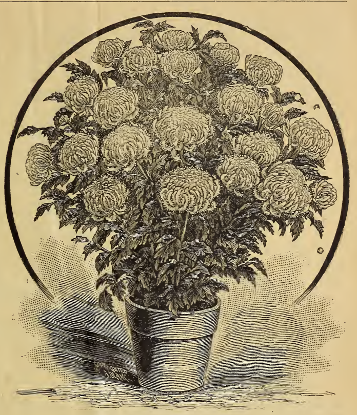
MRS. ALPHEUS HARDY.

G. F. Moseman—An extra large variety, of the perfect overlapping type, 8 to 9 inches in diameter; color deep chamois, each petal lined with terra cotta. A fine grower. $1.00 per doz.