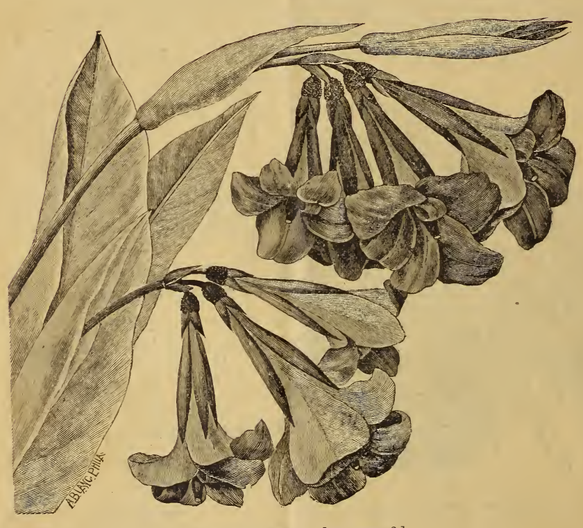
CANNA EHEMANNI, [SEE PAGE 3.]