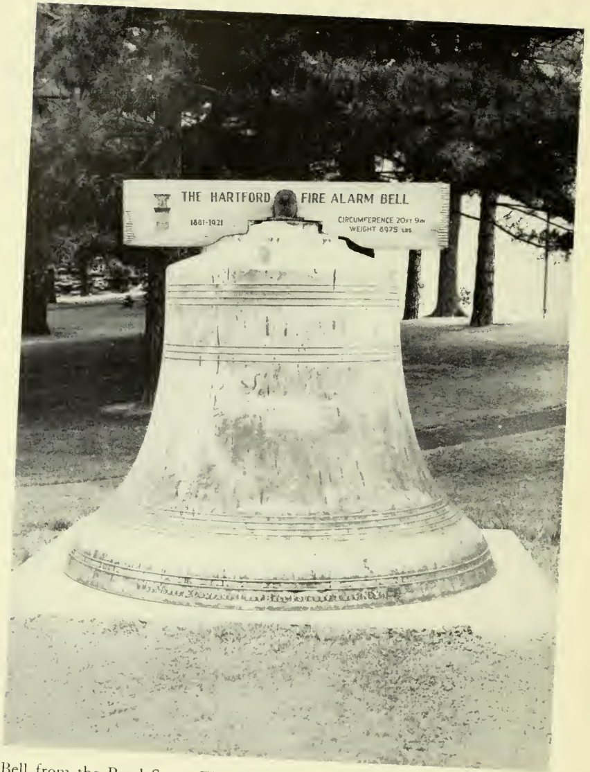
Bell from the Pearl Street Fire Tower, installed on our grounds near the parking lot