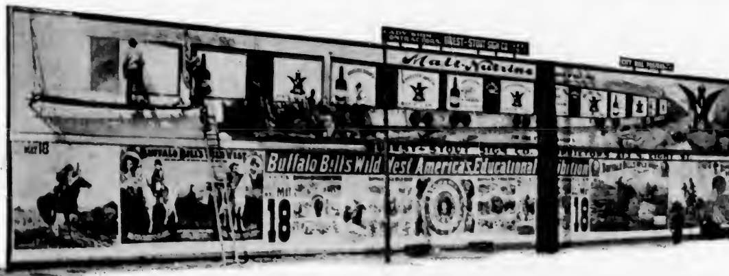
A HUIEST-STOUT SIGN COMPANY'S (ST. LOUIS) BILLBOARD.