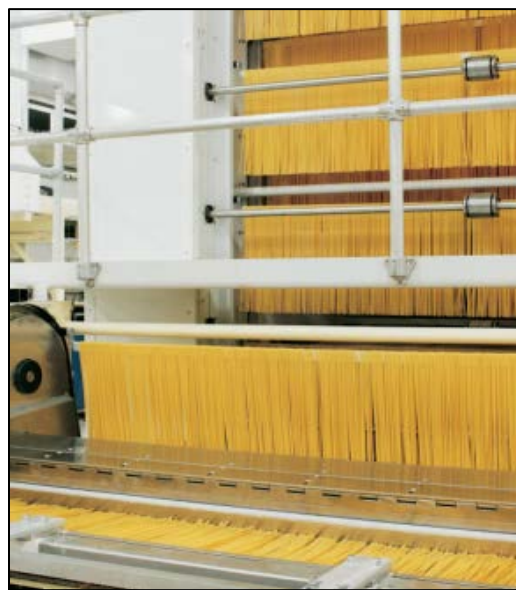
Stripper taking pasta off drying stick and getting ready for trimming to length. Multi-level accumulator in background.