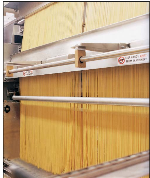
Spreader with long goods pasta extruding and getting ready for placement on drying stick.

Stripper. Removes pasta from drying sticks and cuts product to length.