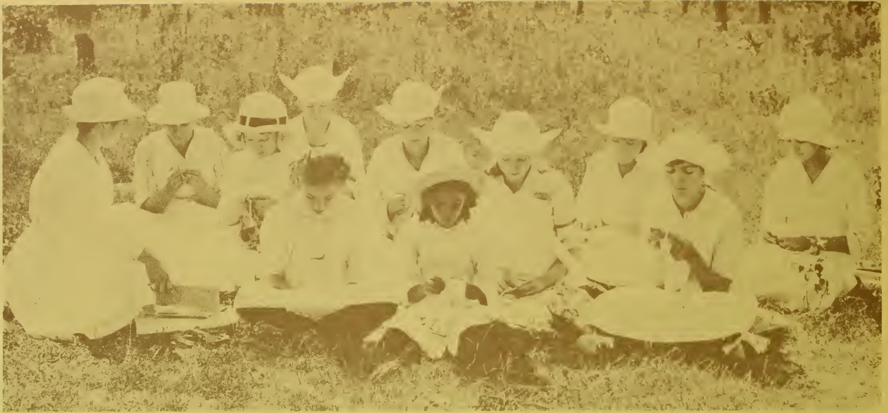
Crisp white caps were uniform-of-the-day for this 1917 Maryland 4-H sewing club.