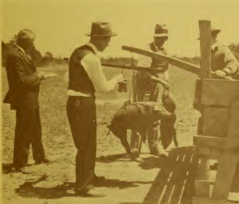
Weighing pigs was part of the job for Extension specialists in North Carolina in 1929.

Who was the first state director of Extension? Depends partly on how you define the terminology used to describe the job. Cornell University established an "Extension Program" in 1894 with a state appropriation, and named Liberty Hyde Bailey as