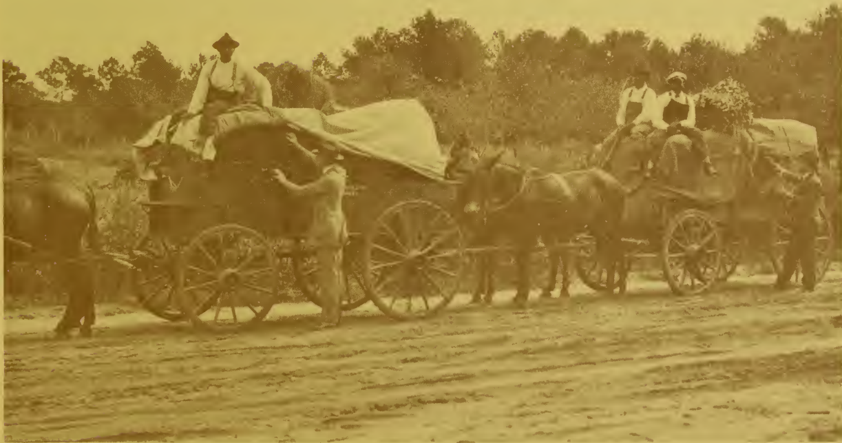
A North Carolina tobacco wagon train stopped on the way to market for inspection by the county agent in 1924.