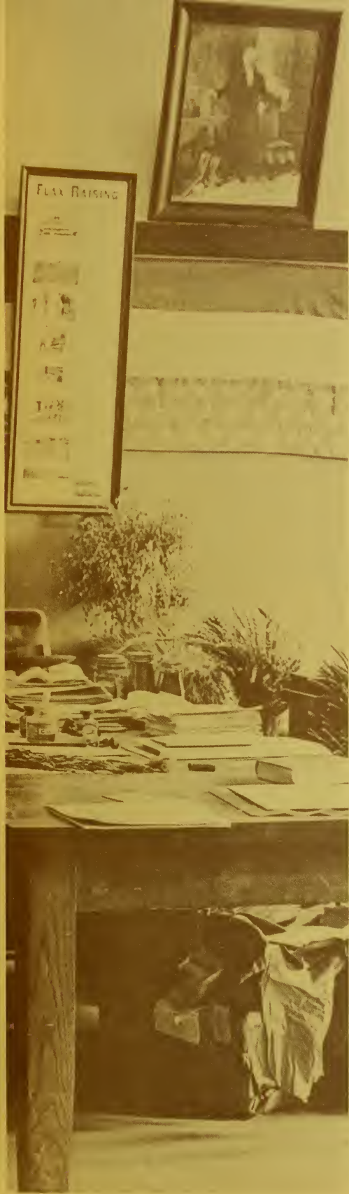
This Montana county agent's office typified the Extension base of operations in 1919.

national and state levels for several decades before the formal format of disseminating educational information was established by the U.S. Congress in 1914: