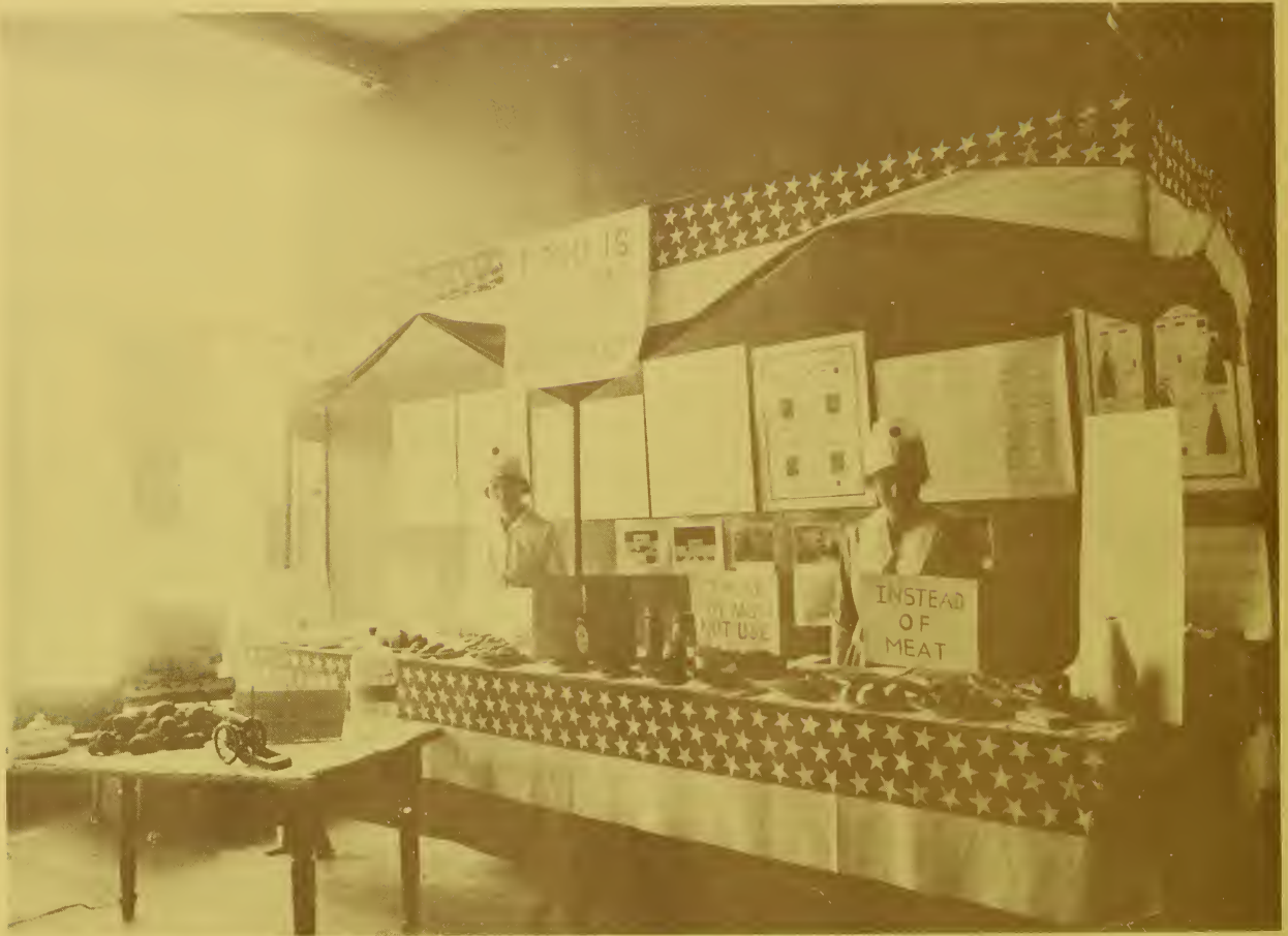
Food as "ammunition" to win the war was shown at this 1918 Vermont Extension exhibit.

tension Service that you can add from your own experience and the programs of Extension in your own state.