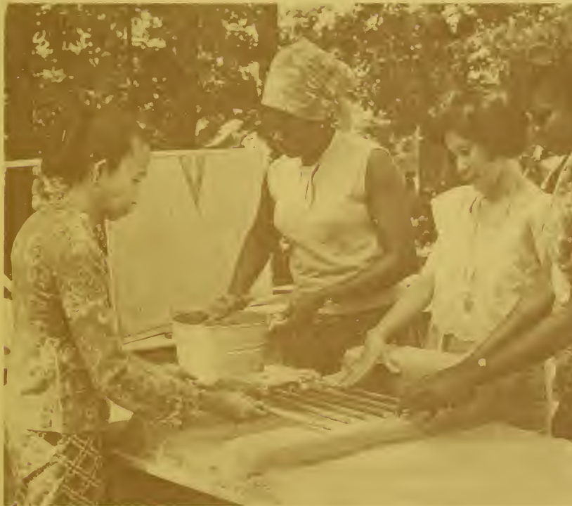
In a 1969 U.S. Extension workshop, women from developing countries learned skills to teach others at home.