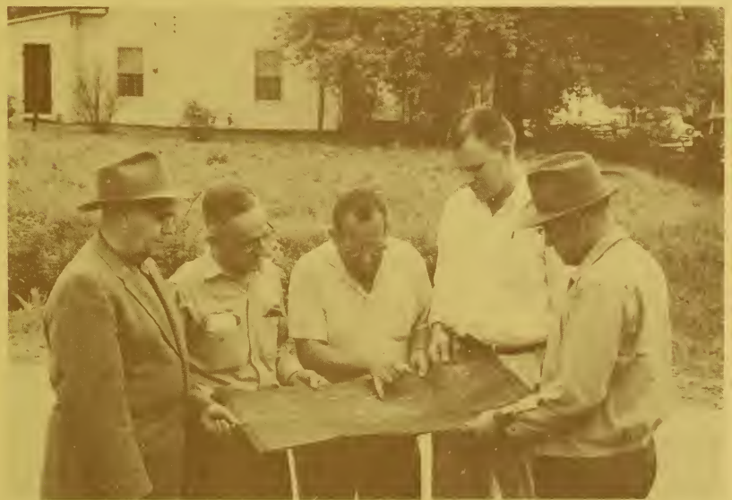
Local leaders planned community improvements for Butler County, Kentucky, in the 1950's.