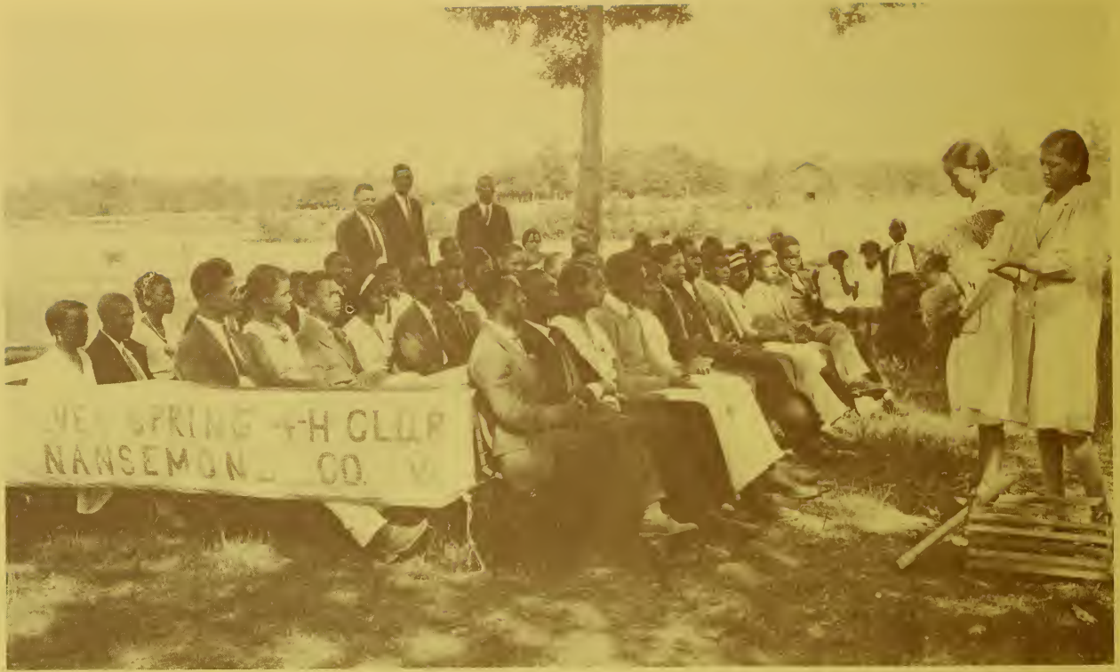
On a spring day in 1932, Virginia 4-H'ers watched a culling demonstration at an outdoor meeting.