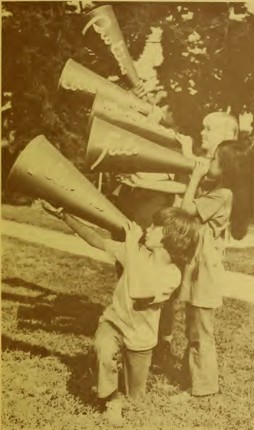
The "Mulligan Stew" gang blow their horns for nutrition in the popular 4-H television series of the early 1970's.

been interested in developing their youth into responsible adults for a long, long time. But, about 1902, they seemed to start "putting it together" in a format that worked. Take your choice on which state was first—probably the one you live in! The records indicate: