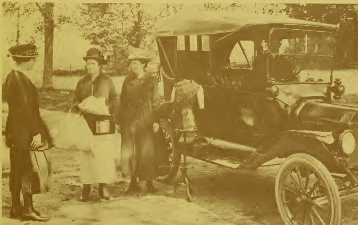
Homemakers of the 1920's arrived in their best bonnets with equipment for an Extension clothing demonstration.

The growth of Extension was interwoven with actions at both the