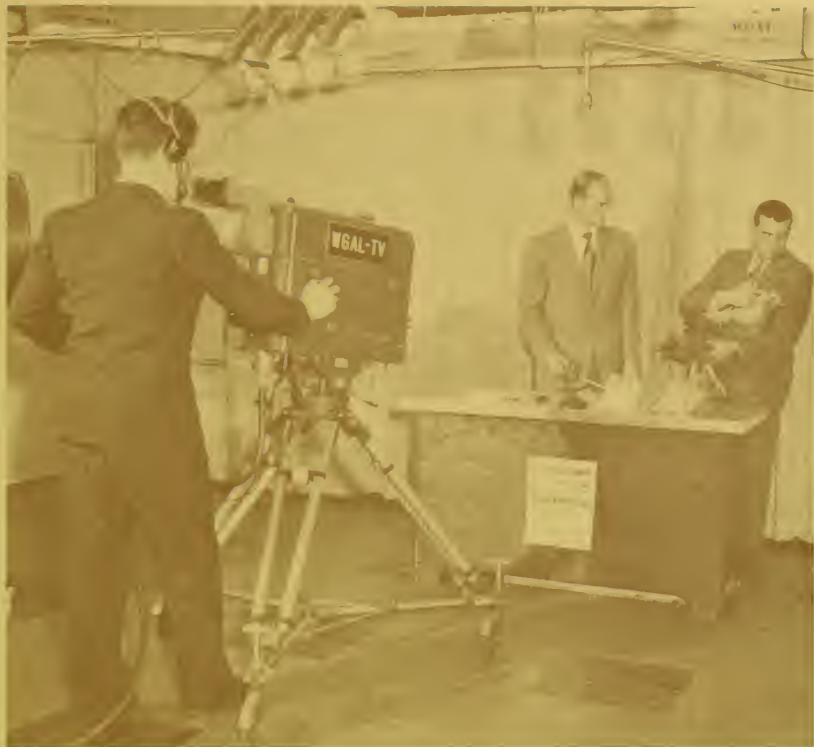
Pennsylvania county Extension agents brought animals into the studio in the mid-50's to liven up telecasts.