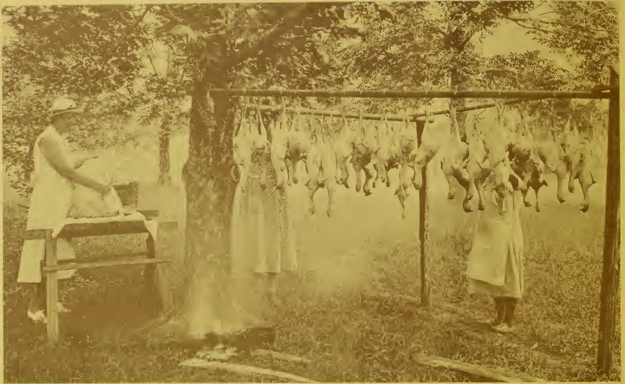
A Florida homemakers club plucked 200 pounds of chicken to sell as a co-op order. (1935)

farm and home development programs and rural development efforts. His leadership in FES was recognized by Secretary Benson with his promotion to Assistant Secretary in 1960.