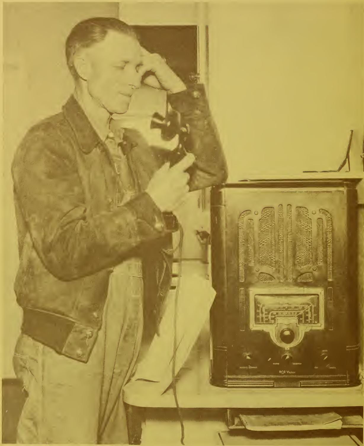
Electronic communication—radio and telephone—speeded information from the county Extension office to the public in the 1930's.