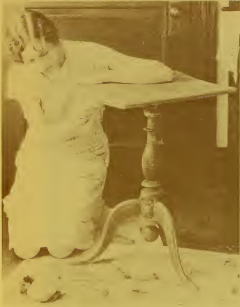
Refinishing furniture was a favorite 4-H project in 1928.