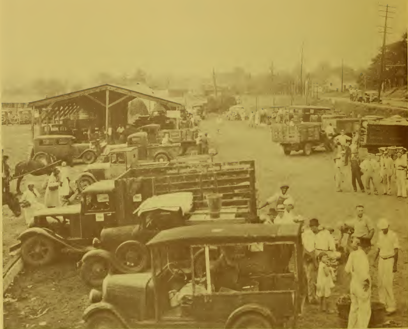
Local farmers flocked to this 1935 growers' market set up by Extension in Muscogee County, Georgia.