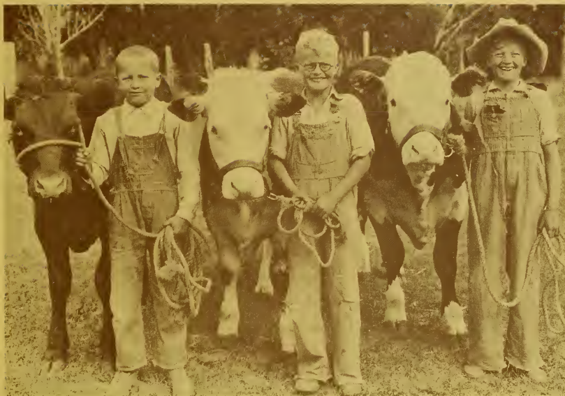
Proud smiles of these 4-H boys reflect their hopes for a prize at a 1933 county fair.