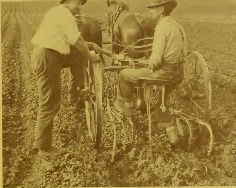
A county agent and farmer pause to ponder the 1925 potato crop prospects in Oregon.

USDA assigned the Extension Service leadership for this new effort called the "Expanded Food and Nutrition Education Program" (EFNEP). Conducted by the home economics and 4-H staffs at the state and county levels, the key element of EFNEP was the training of paraprofessionals (aides) in selected communities to make one-to-one contact with people needing help. EFNEP has enrolled 1,234,000 families in 6 years (1969-75), making it the biggest shot in the arm for Extension home economics since home demonstration agents started driving from door to door in a Model T Ford.