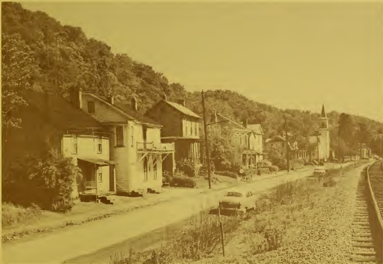
A pilot program in "rural development" recognized the problems of rural towns like this one in the mid-1950's.

There are many other examples of service to people and strengths of Ex-