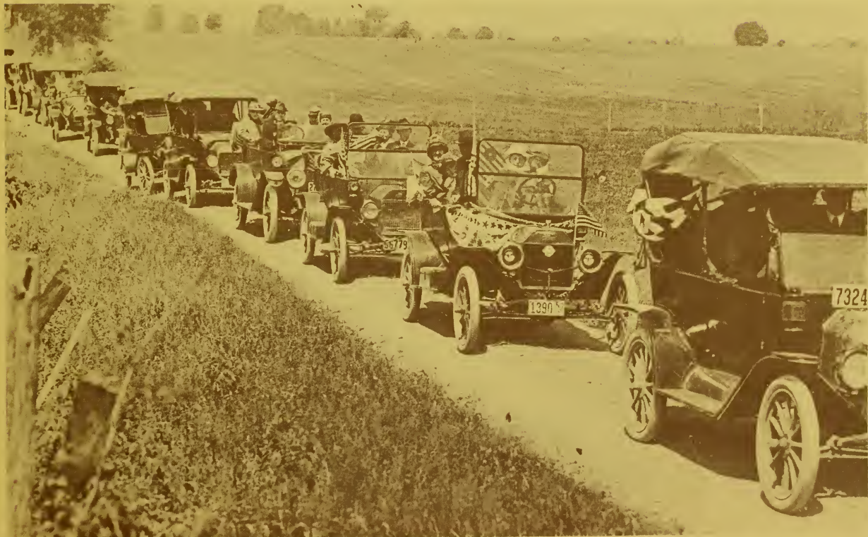
In 1916, this county agent's tour made a popular outing for Indiana farm families.