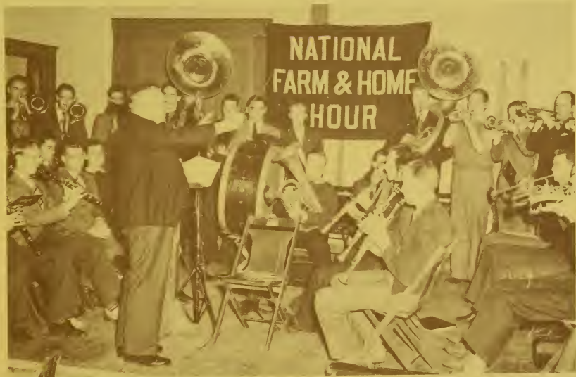
Network radio reached large farm audiences with the "National Farm and Home Hour" from 1928 to 1960.

In 1968, the first nationally developed 4-H series featuring photography preceded Mulligan Stew .