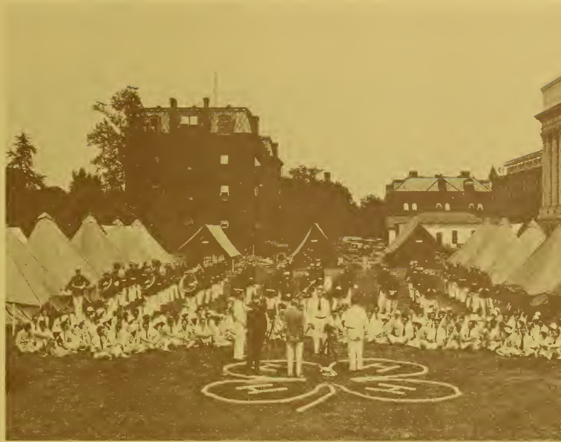
4-H'ers at the fourth national club camp in Washington, D. C., pitched their tents near the USDA Administration Building. (June 1930)

By the fifties the 4-H Club program had added a new phase, now called "special interest groups"—one of the fastest growing areas of 4-H work today. Volunteer local leaders determine much of the success of Extension youth programs.