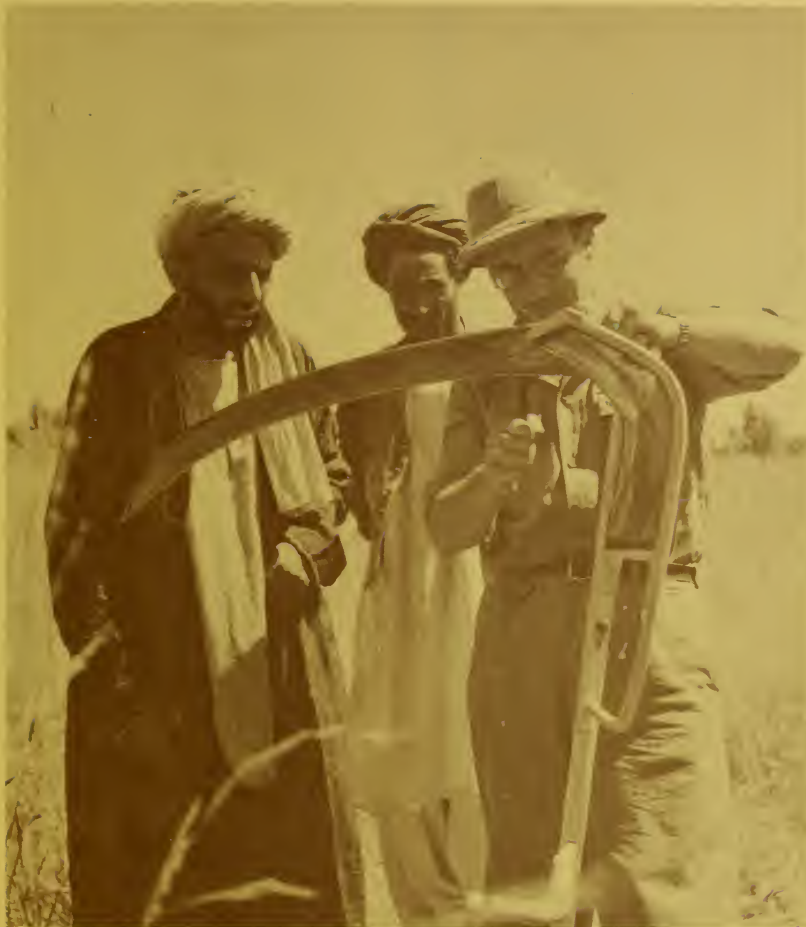
"Showing how" in Afghanistan—a U.S. Extension specialist on the job in 1958.

system of teaching the farm wife and farm girl the elementary principles of home making and home management, and your committee believes there is no more important work in the country than is this".