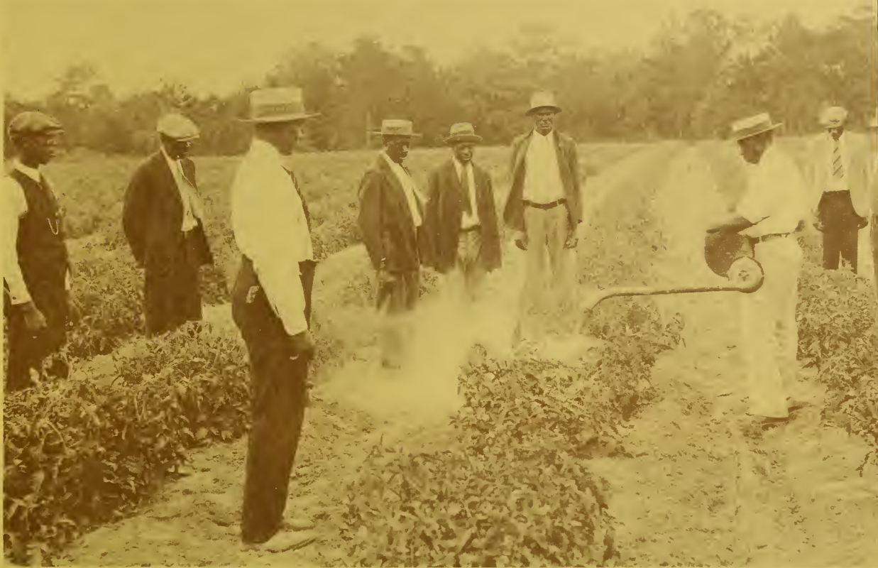
Hand dusting was "pest management" for this South Carolina tomato patch in 1932.