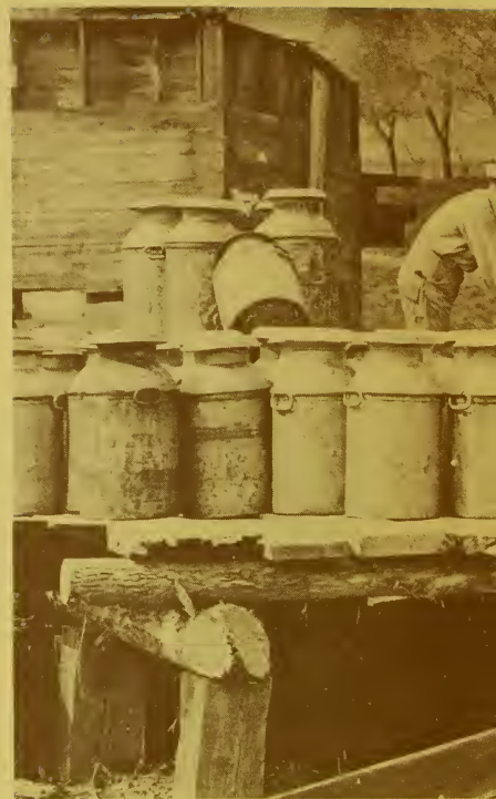
The trip from farm to processor was made easier and safer in 1920 by Extension know-how.

In June, 1936, a group of Extension homemakers met at USDA in Washington, D.C., and—you guess it—organized! They formed the