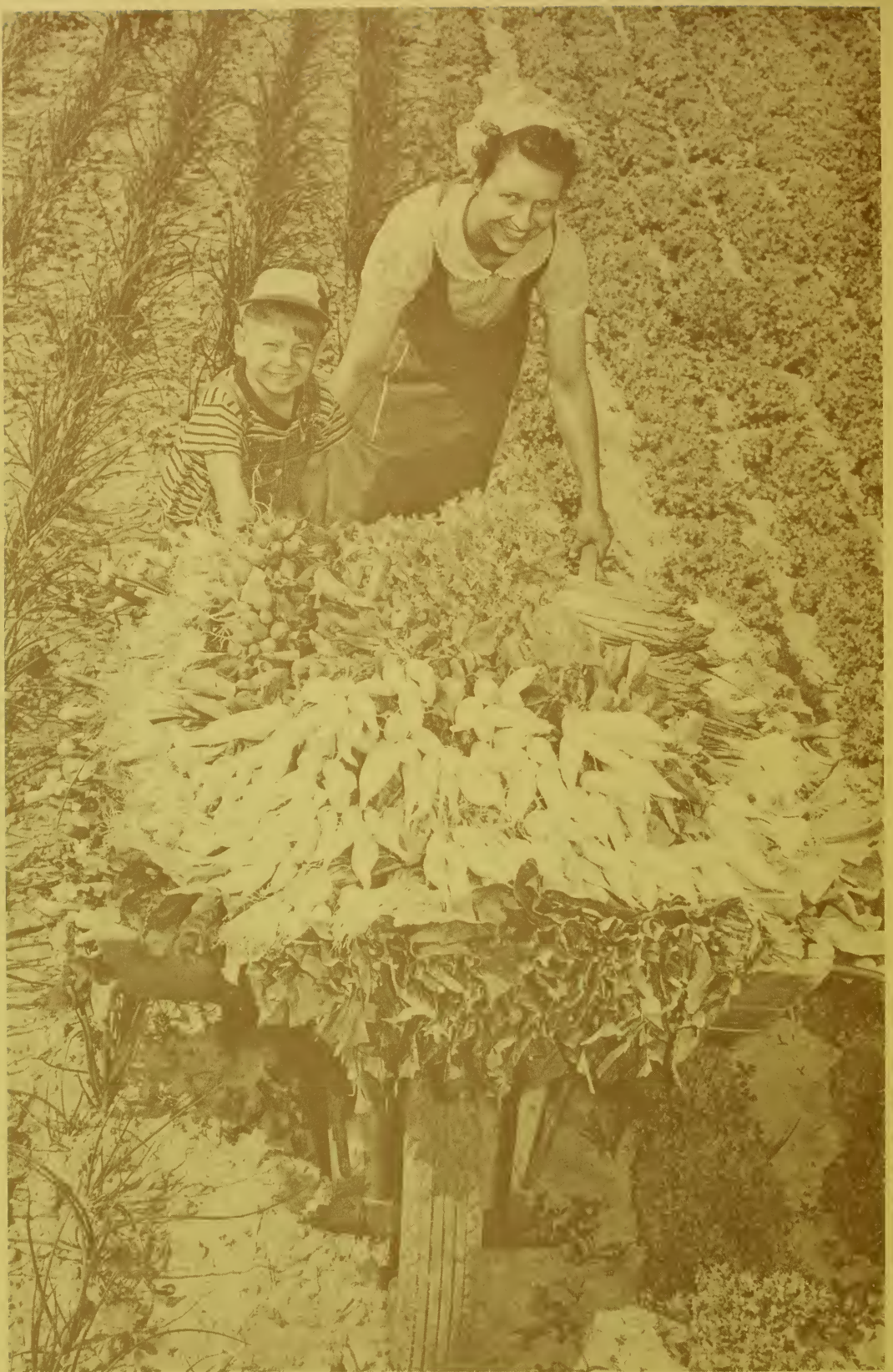
During World War II, Extension promoted victory gardens on the home front.