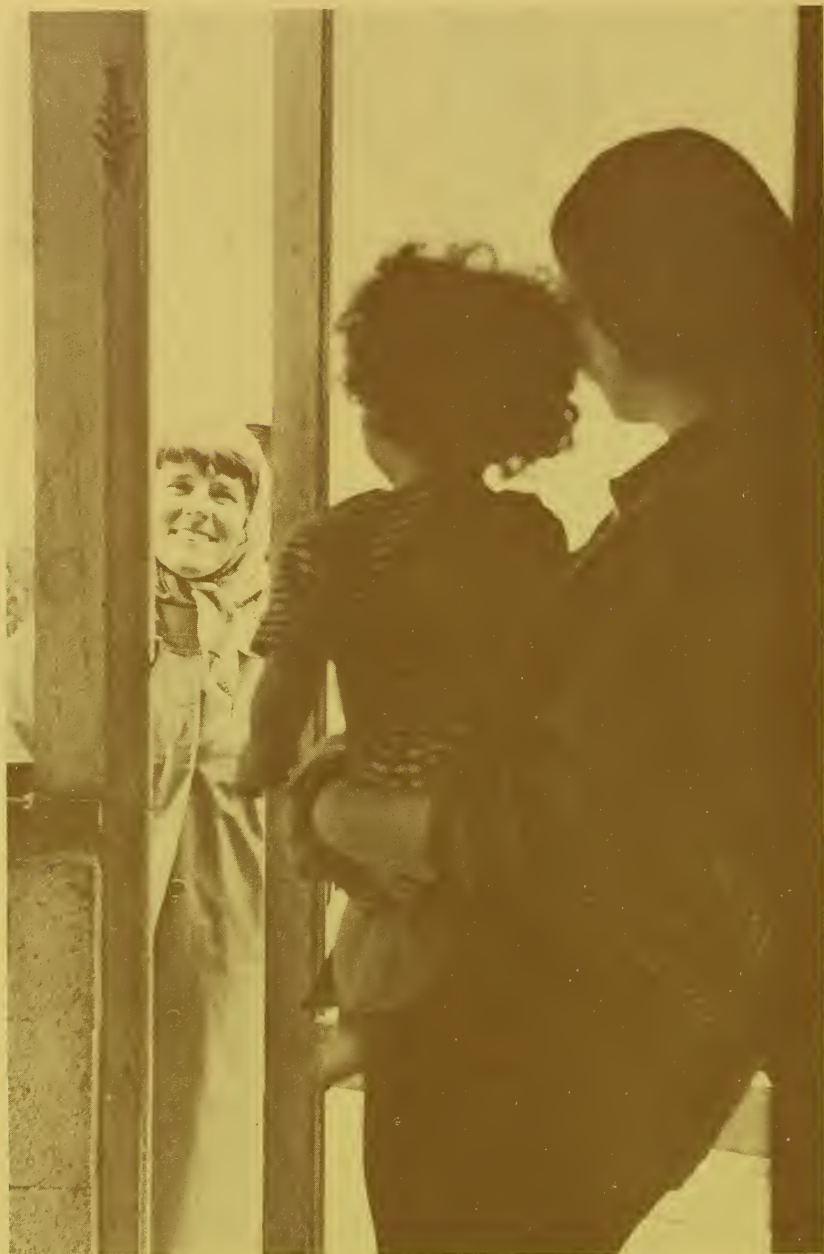
EFNEP nutrition aides bring health and hope to low-income families.

grain, milk, livestock, and fruit and vegetables. Co-ops started to supply farmers the fuel, feed, and agricultural chemicals they needed.