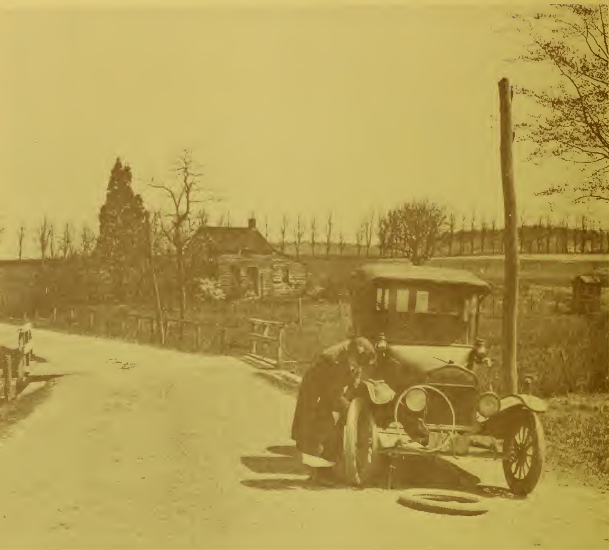
Extension women have always been “liberated”—this home demonstration agent fixed her own flat.