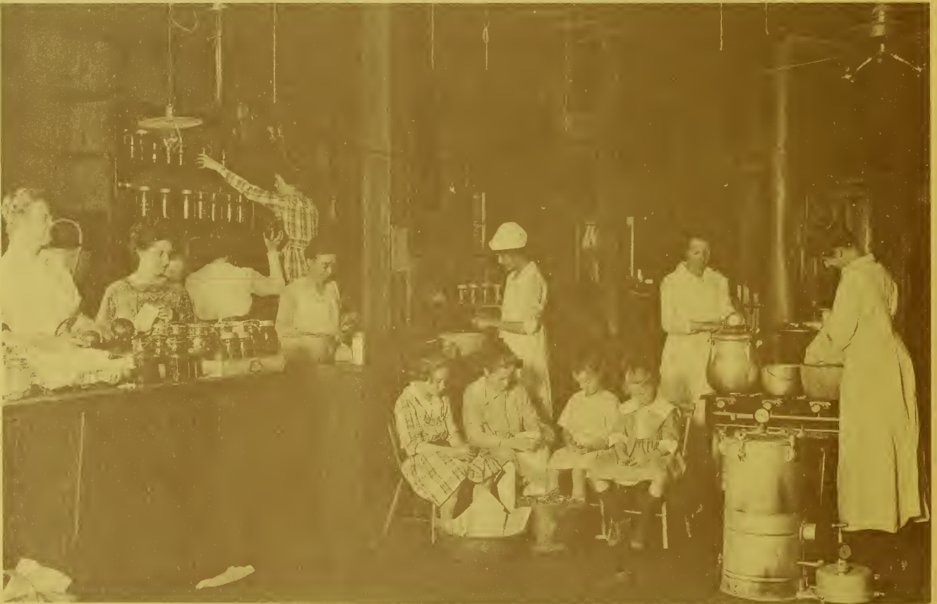
Community canning was a mother-daughter project. (1918)