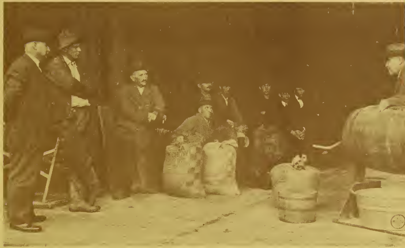
An Extension agronomist and a group of Maryland farmers discussed seed treatment in 1926.