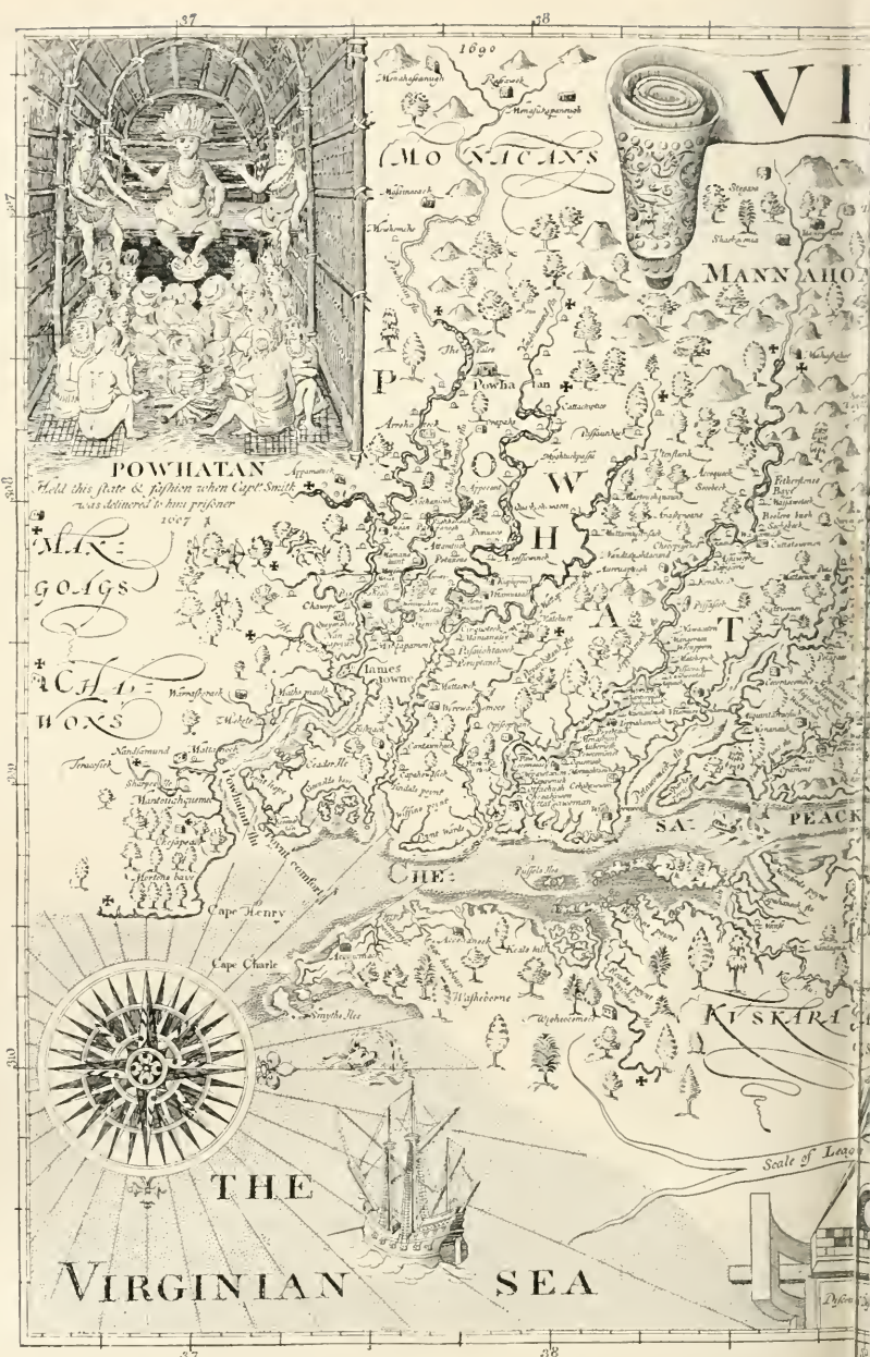
SMITH'S MAP OF VIRGINIA