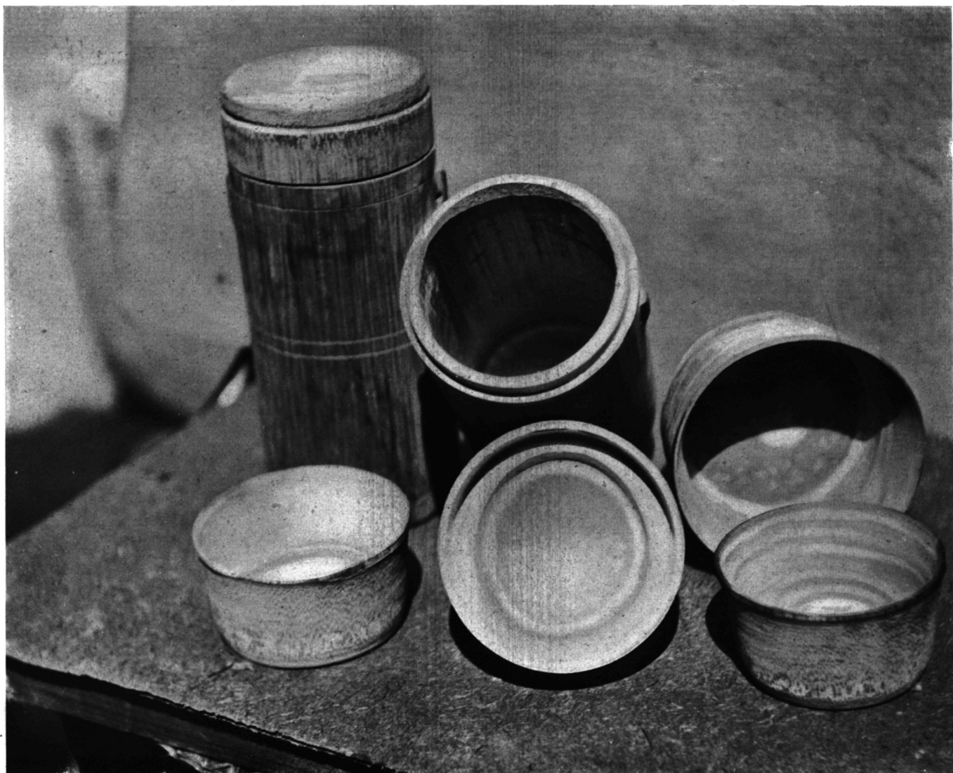
Bamboo Utensils from Shantung, China. Phyllostachys sp.

Cups and jars from bamboo joints, obtained in Tsao chou fu, Shantung, China. Peking, China, April 24, 1914. These utensils, apparently turned on an ordinary lathe, show some of the possibilities of bamboo, not usually considered in this country. It may be that the turning by removing the epidermis makes the dishes less likely to crack in a dry atmosphere. In American steam-heated houses bamboo utensils appear at a decided disadvantage because they dry unevenly and crack. Such as are used for outdoor purposes, however, last a long time, are exceedingly cheap and light and pleasing to look at.